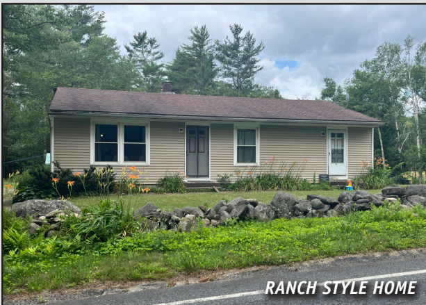
RANCH STYLE HOME