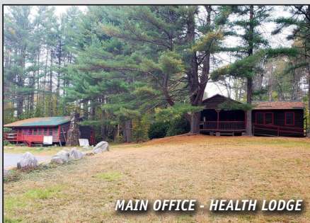
MAIN OFFICE - HEALTH LODGE

FRIDAY, OCTOBER 3 RD AT 11:00 A.M. 22 & 27 SUGAR HILL ROAD WILLIAMSBURG, MASSACHUSETTS