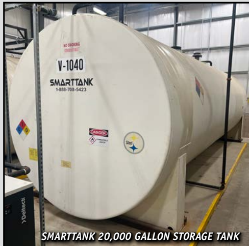
SMARTTANK 20,000 GALLON STORAGE TANK