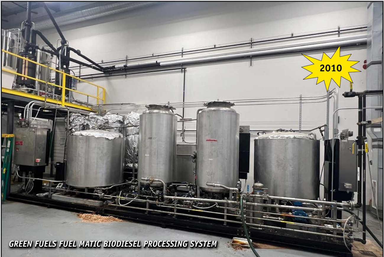
GREEN FUELS FUEL MATIC BIODIESEL PROCESSING SYSTEM

& MORNING OF SALE – 8:30 A.M. TO 11:00 A.M. OR UPON REQUEST