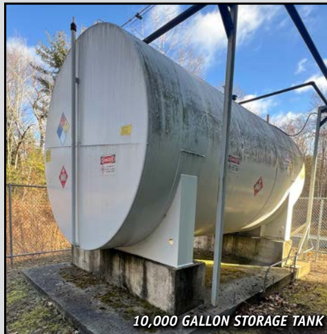
10,000 GALLON STORAGE TANK