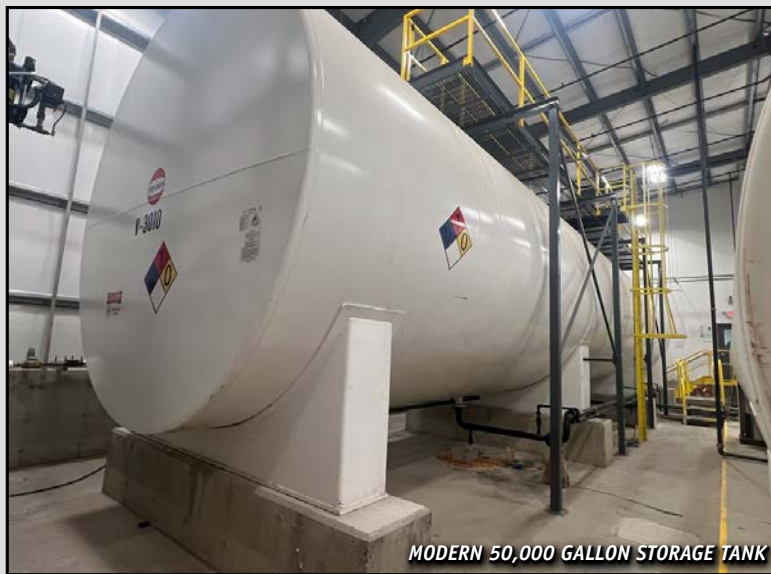
MODERN 50,000 GALLON STORAGE TANK