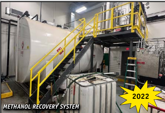
METHANOL RECOVERY SYSTEM