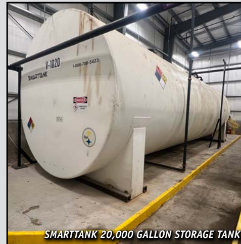
SMARTTANK 20,000 GALLON STORAGE TANK