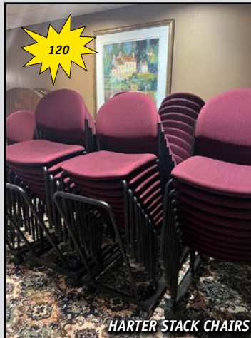
HARTER STACK CHAIRS