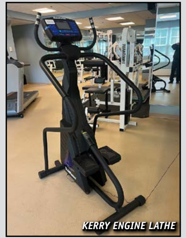
KERRY ENGINE LATHE