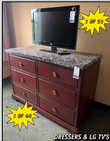
DRESSERS & LG TV'S