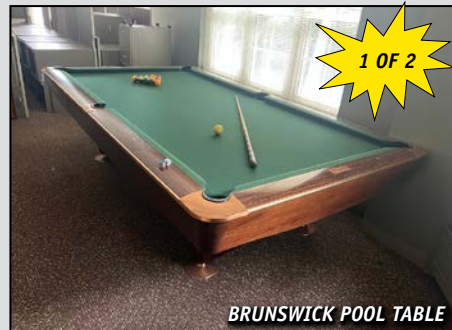
BRUNSWICK POOL TABLE