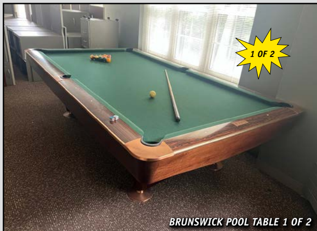
BRUNSWICK POOL TABLE 1 OF 2