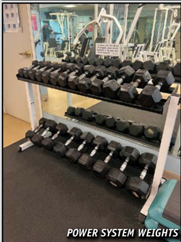
POWER SYSTEM WEIGHTS