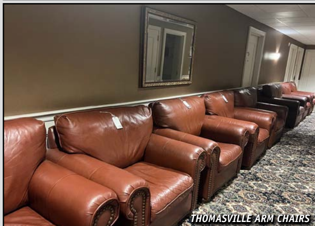
THOMASVILLE ARM CHAIRS