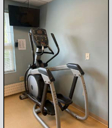
MATRIX ELLIPTICAL MACHINE