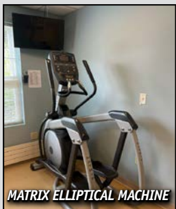
MATRIX ELLIPTICAL MACHINE