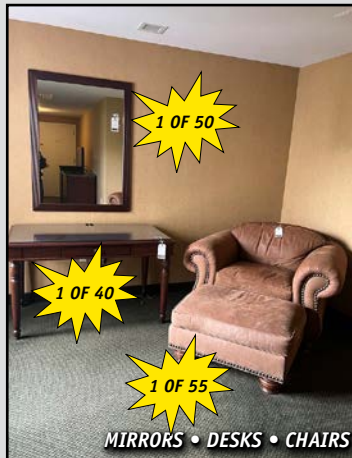
MIRRORS • DESKS • CHAIRS