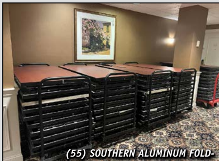
(55) SOUTHERN ALUMINUM FOLD-