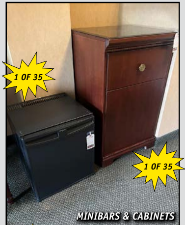
MINIBARS & CABINETS