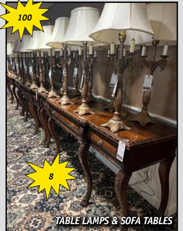
TABLE LAMPS & SOFA TABLES