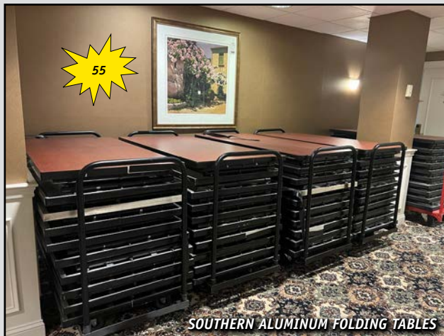
SOUTHERN ALUMINUM FOLDING TABLES