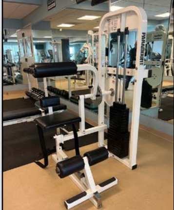
PARAMOUNT BACK-AB-CHEST STATION