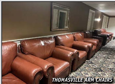
THOMASVILLE ARM CHAIRS