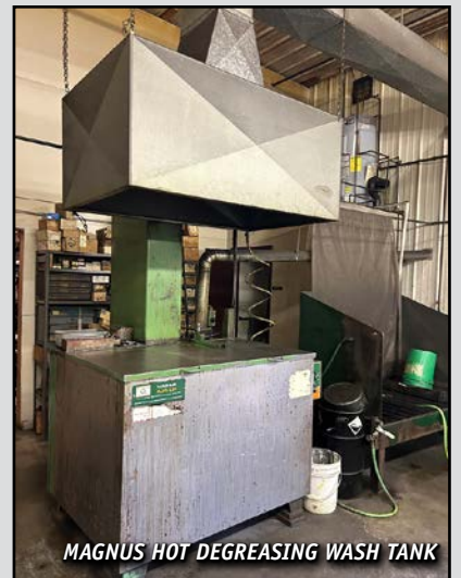
MAGNUS HOT DEGREASING WASH TANK