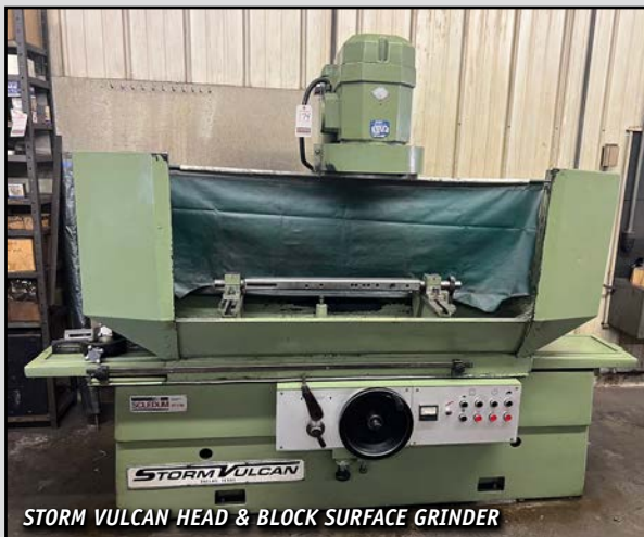
STORM VULCAN HEAD & BLOCK SURFACE GRINDER