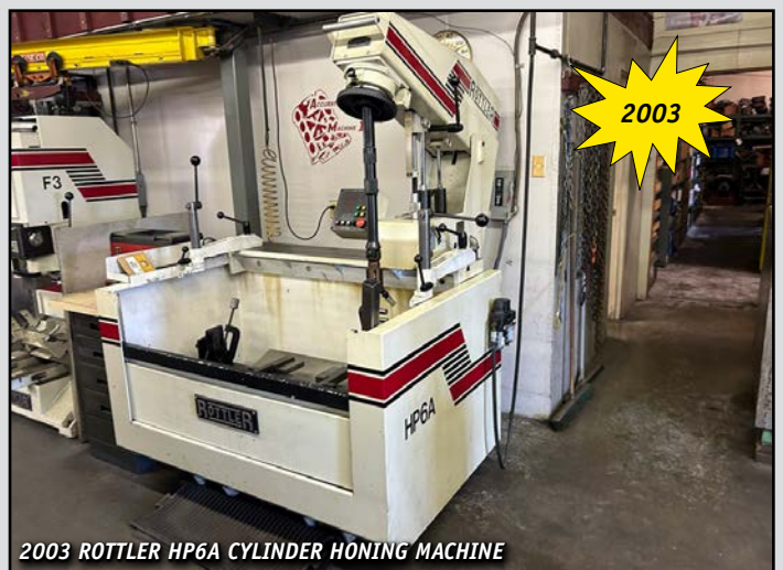
2003 ROTTLER HP6A CYLINDER HONING MACHINE