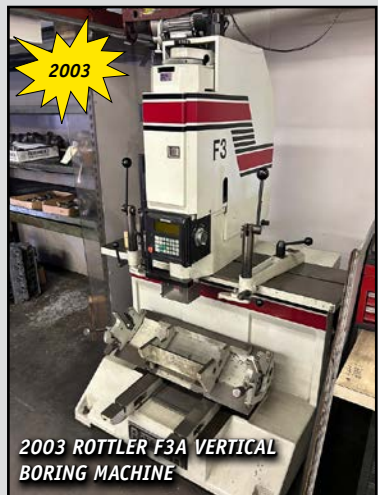
2003 ROTTLER F3A VERTICAL BORING MACHINE