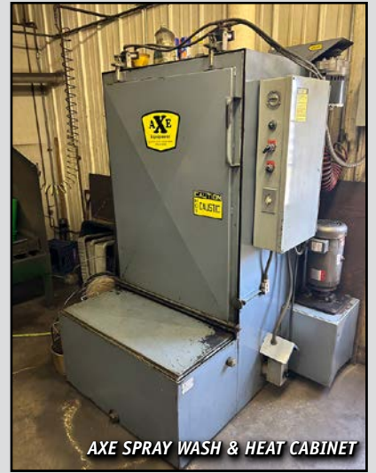
AXE SPRAY WASH & HEAT CABINET