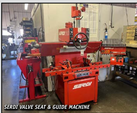
SERDI VALVE SEAT & GUIDE MACHINE

TUESDAY, OCTOBER 22 ND AT 11:00 A.M. (ET) 770 NEWFIELD STREET, MIDDLETOWN, CONNECTICUT