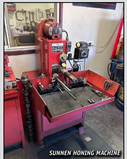
SUNNEN HONING MACHINE