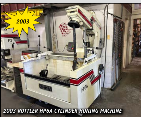
2003 ROTTLER HP6A CYLINDER HONING MACHINE

HELD ON OCTOBER 22 ND , 2024. NO PURCHASE REMOVED UNTIL COMPLETE SETTLEMENT IS MADE. OTHER TERMS TO BE ANNOUNCED AT TIME OF SALE.