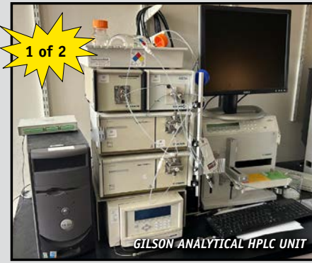
GILSON ANALYTICAL HPLC UNIT