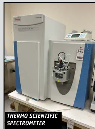
THERMO SCIENTIFIC SPECTROMETER