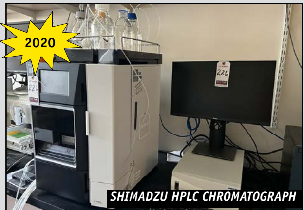
SHIMADZU HPLC CHROMATOGRAPH