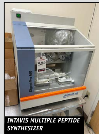
INTAVIS MULTIPLE PEPTIDE SYNTHESIZER