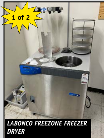
LABONCO FREEZONE FREEZER DRYER