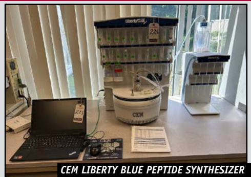
CEM LIBERTY BLUE PEPTIDE SYNTHESIZER