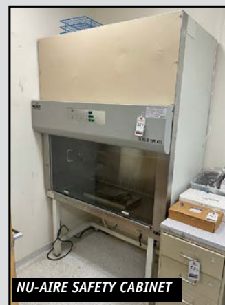
NU-AIRE SAFETY CABINET