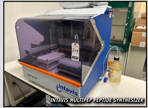
INTAVIS MULTIPREP PEPTIDE SYNTHESIZER