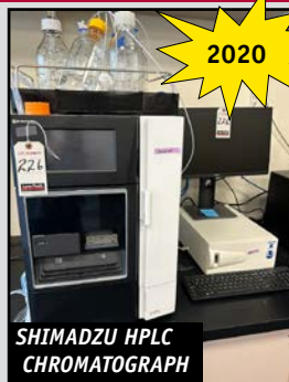
SHIMADZU HPLC CHROMATOGRAPH