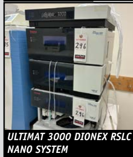
ULTIMAT 3000 DIONEX RSLC NANO SYSTEM