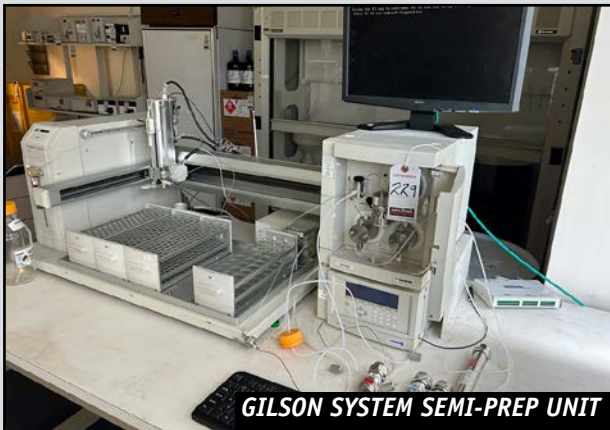
GILSON SYSTEM SEMI-PREP UNIT