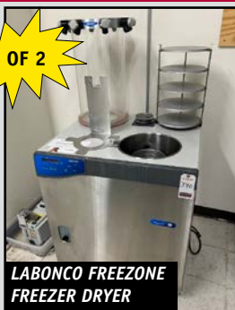
LABONCO FREEZONE FREEZER DRYER