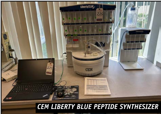
CEM LIBERTY BLUE PEPTIDE SYNTHESIZER

INSPECTIONS: THURSDAY, OCTOBER 9 TH , 10:00 A.M. TO 4:00 P.M. & MORNING OF SALE – 8:30 A.M. TO 11:00 A.M.