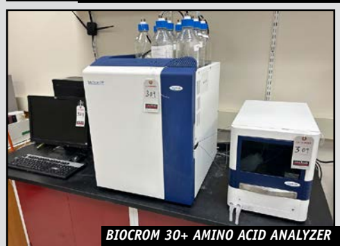
BIOCROM 30+ AMINO ACID ANALYZER