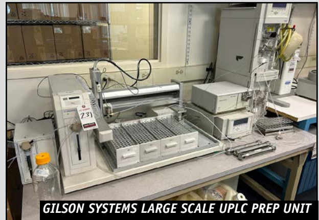
GILSON SYSTEMS LARGE SCALE UPLC PREP UNIT