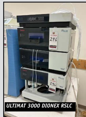
ULTIMAT 3000 DIONEX RSLC