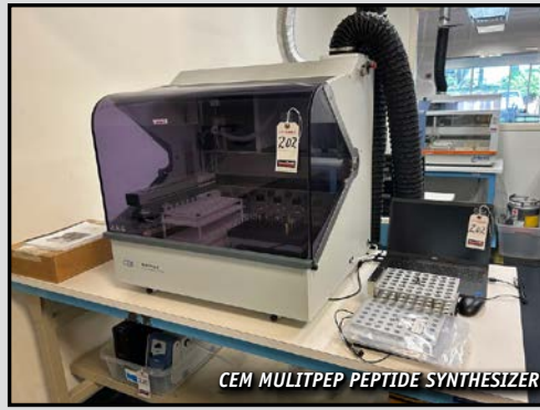
CEM MULTIPREP PEPTIDE SYNTHESIZER