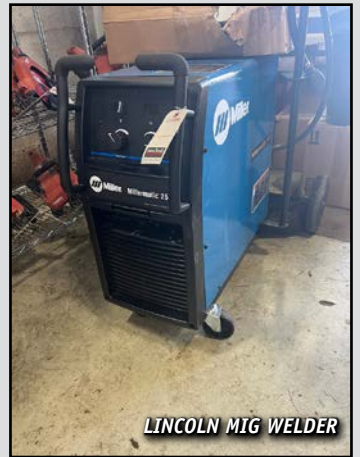
LINCOLN MIG WELDER