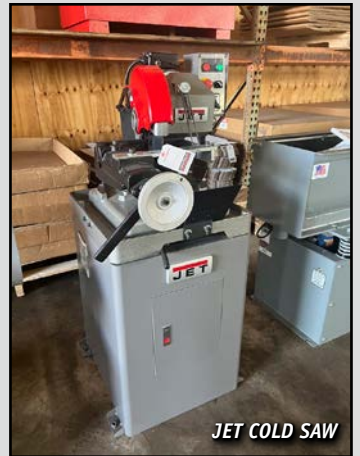
JET COLD SAW