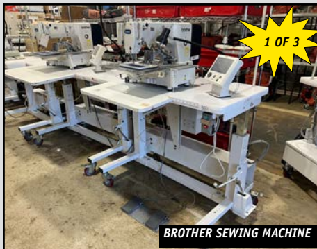
BROTHER SEWING MACHINE

INSPECTIONS: WEDNESDAY, JUNE 19 TH – 10:00 A.M. TO 4:00 P.M. & DAY OF SALE – 8:30 A.M. TO 1:00 P.M.