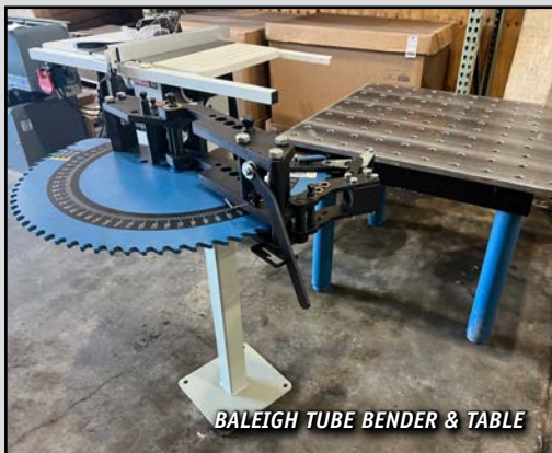
BAILEIGH TUBE BENDER & TABLE