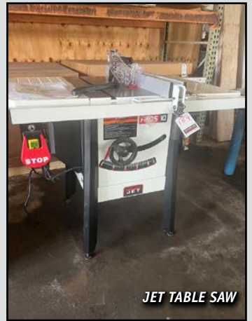
JET TABLE SAW