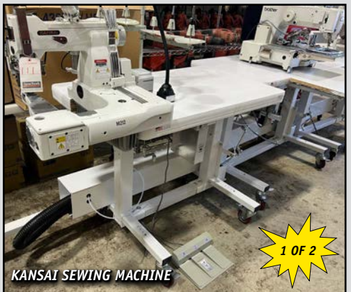
KANSAI SEWING MACHINE