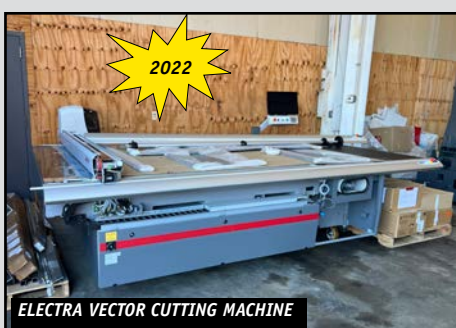
ELECTRA VECTOR CUTTING MACHINE

160 TAPLEY STREET SPRINGFIELD, MASSACHUSETTS