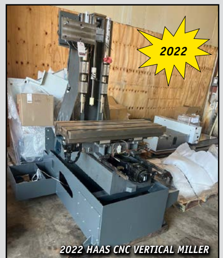
2022 HAAS CNC VERTICAL MILLER