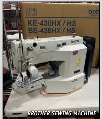
BROTHER SEWING MACHINE