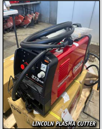
LINCOLN PLASMA CUTTER