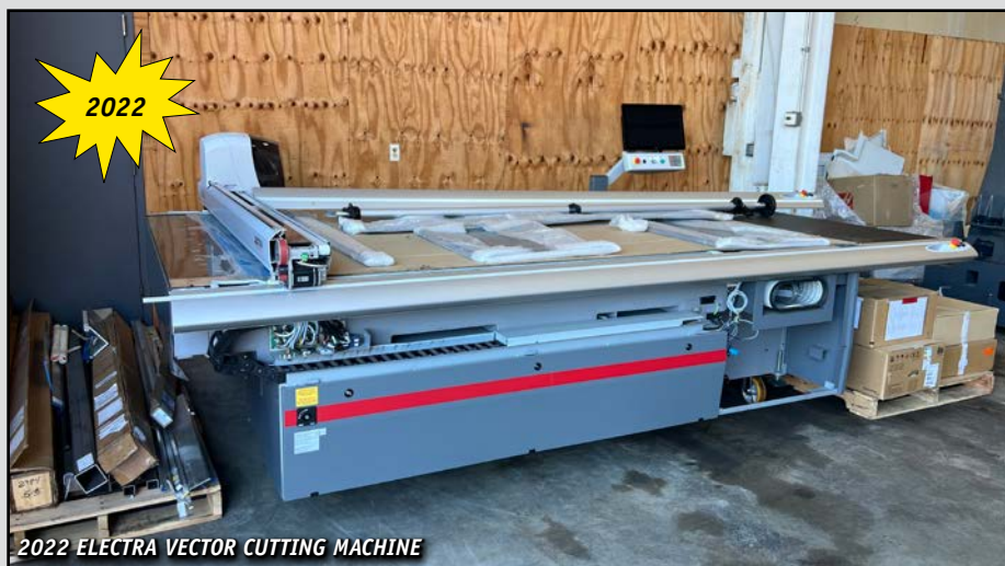
2022 ELECTRA VECTOR CUTTING MACHINE