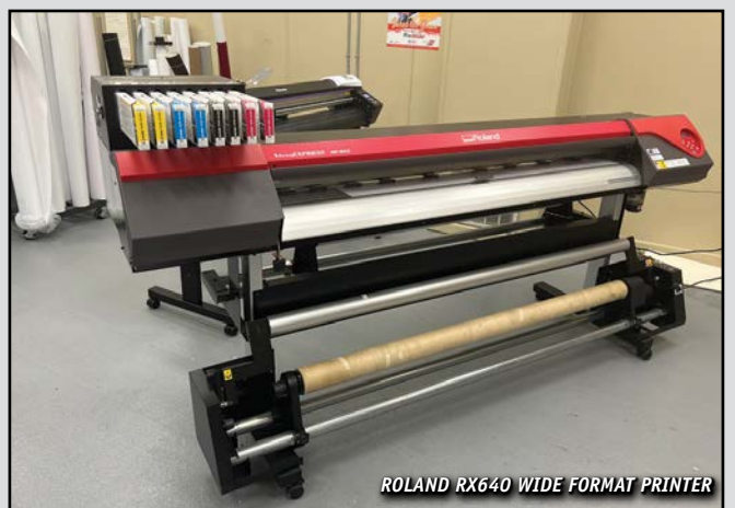
ROLAND RX640 WIDE FORMAT PRINTER