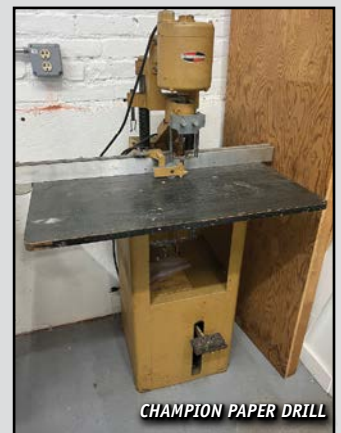
CHAMPION PAPER DRILL

COPIER • 2017 Ricoh Pro C5200S Color Laser Copier, Printer, Scanner w/ Fiery Color Control #E24B, 4-Paper Trays & Collator •