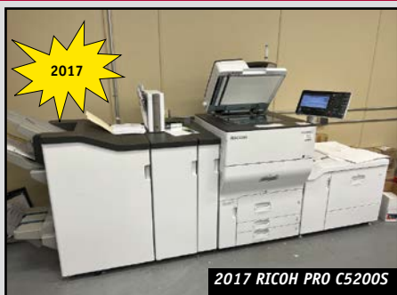
2017 RICOH PRO C5200S

TUESDAY, JUNE 27 TH AT 11:00 A.M. (ET) 91 UNION STREET WEST SPRINGFIELD, MASSACHUSETTS