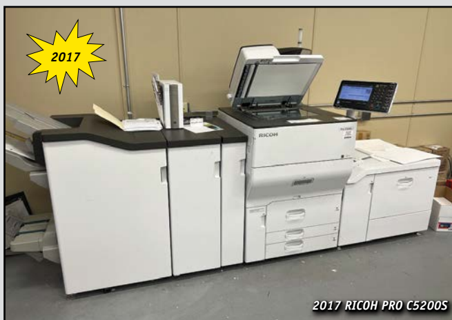
2017 RICOH PRO C5200S