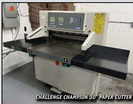
CHALLENGE CHAMPION 30" PAPER CUTTER