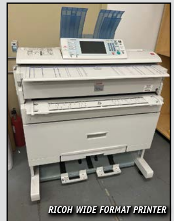
RICOH WIDE FORMAT PRINTER