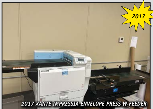
2017 XANTE IMPRESSIA ENVELOPE PRESS W-FEEDER