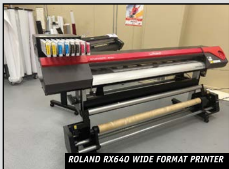
ROLAND RX640 WIDE FORMAT PRINTER

15% BUYERS PREMIUM APPLIES ON ALL ONSITE PURCHASES 18% BUYERS PREMIUM APPLIES ON ALL ONLINE PURCHASES