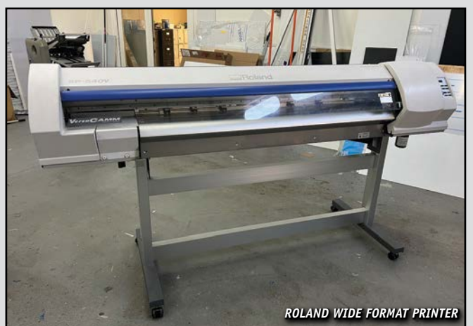
ROLAND WIDE FORMAT PRINTER