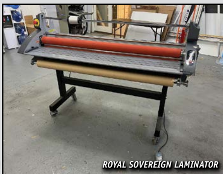
ROYAL SOVEREIGN LAMINATOR