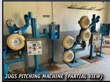
JUGS PITCHING MACHINE (PARTIAL VIEW)