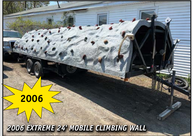
2006 EXTREME 24' MOBILE CLIMBING WALL