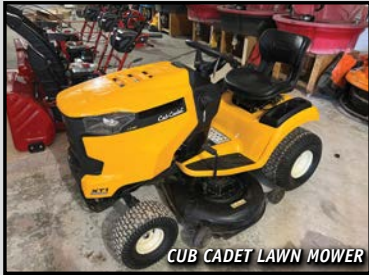
CUB CADET LAWN MOWER