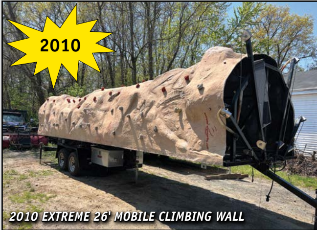
2010 EXTREME 26' MOBILE CLIMBING WALL

INSPECTIONS: WEDNESDAY, MAY 17 TH - 10:00 A.M. TO 4:00 P.M. & MORNING OF SALE - 8:30 A.M. TO 11:00 A.M.