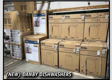
(NEW) DANBY DISHWASHERS