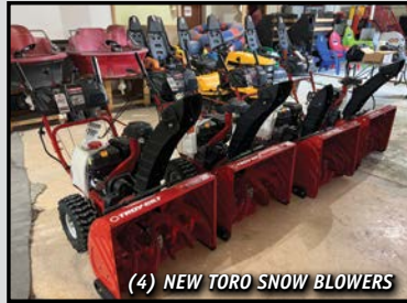
(4) NEW TORO SNOW BLOWERS