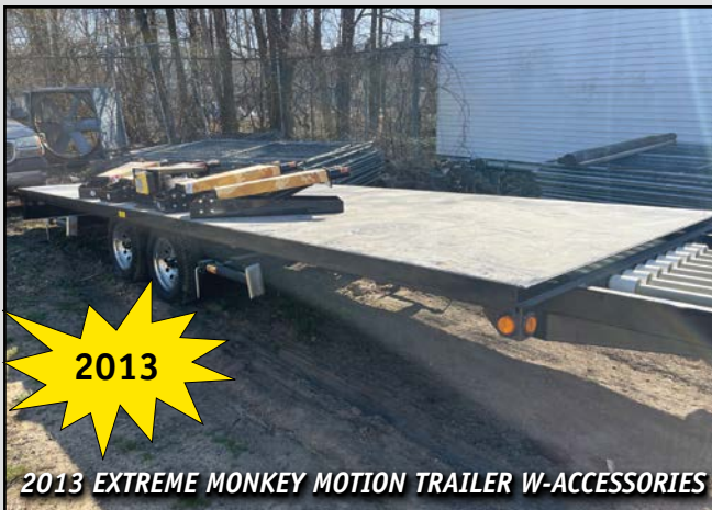
2013 EXTREME MONKEY MOTION TRAILER W-ACCESSORIES