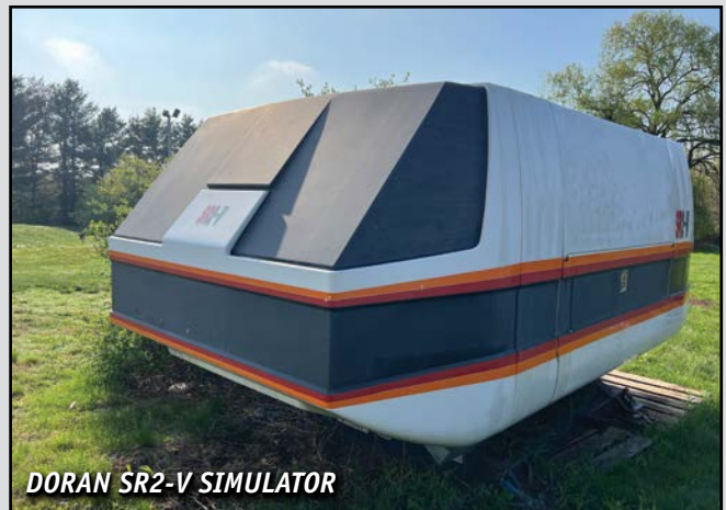
DORAN SR2-V SIMULATOR