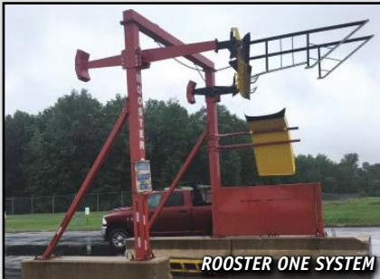
ROOSTER ONE SYSTEM

DEER PARK DRIVE (DEER PARK INDUSTRIAL PARK) EAST LONGMEADOW, MASSACHUSETTS