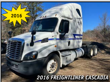
2016 FREIGHTLINER CASCADIA

INSPECTION: TUESDAY, MAY 16 TH - 10:00 A.M. TO 4:00 P.M. & MORNING OF SALE - 8:30 A.M. TO 11:00 A.M.