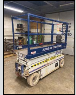
SKYJACK SCISSOR LIFT