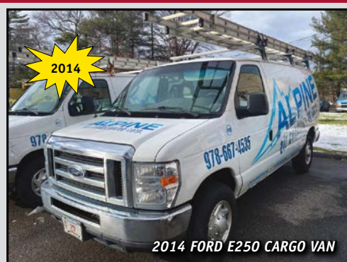
2014 FORD E250 CARGO VAN