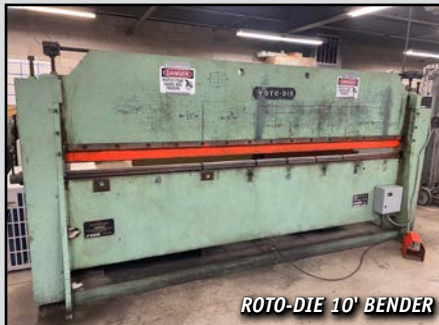
ROTO-DIE 10' BENDER