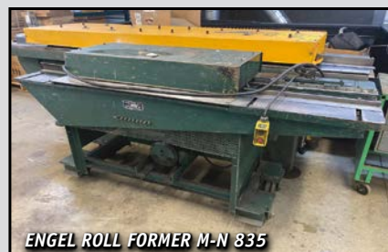
ENGEL ROLL FORMER M-N 835