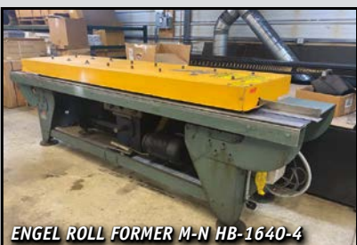
ENGEL ROLL FORMER M-N HB-1640-4