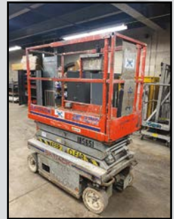
SKYJACK SCISSOR LIFT