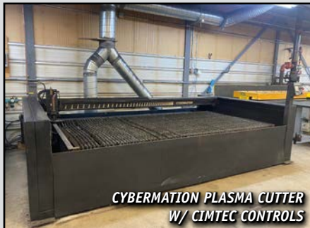
CYBERMATION PLASMA CUTTER W/ CIMTEC CONTROLS

INSPECTION: MORNING OF SALE – 8:30 A.M. TO 11:00 A.M.