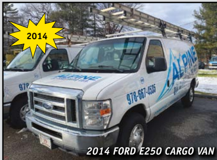
2014 FORD E250 CARGO VAN

25% DEPOSIT BY CASH, CERTIFIED OR BANK CHECK, OR BANK WIRE TRANSFER. 15% BUYERS PREMIUM APPLIES ON ALL ONSITE PURCHASES. 18% BUYERS PREMIUM APPLIES ON ALL ONLINE PURCHASES. PERSONAL OR COMPANY CHECK ACCEPTED ONLY IF ACCOMPANIED WITH A BANK LETTER GUARANTEEING PAYMENT. EXAMPLE OF BANK LETTER OF GUARANTEE: THIS BANK GUARANTEES PAYMENT TO AARON POSNIK & CO., INC. ON ACCOUNT # _____ UP TO THE AMOUNT OF $ _____ FOR PURCHASES MADE AT THE ALPINE AIR CONDITIONING CORP. AUCTION TO BE HELD ON THURSDAY, MARCH 23 RD . NO PURCHASE REMOVED UNTIL COMPLETE SETTLEMENT IS MADE. OTHER TERMS TO BE ANNOUNCED AT TIME OF SALE.