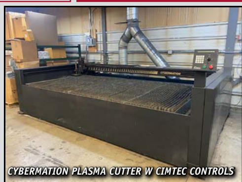
CYBERMATION PLASMA CUTTER W CIMTEC CONTROLS