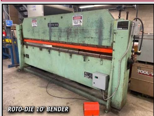
ROTO-DIE 10' BENDER