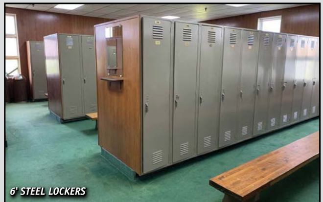
6' STEEL LOCKERS