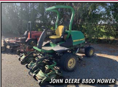
JOHN DEERE 8800 MOWER