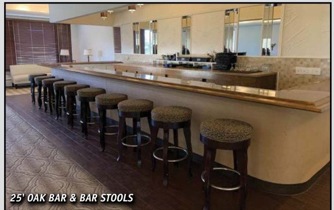
25' OAK BAR & BAR STOOLS