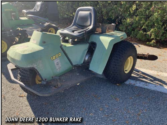
JOHN DEERE 1200 BUNKER RAKE