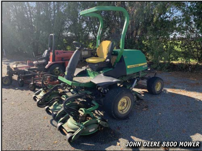
JOHN DEERE 8800 MOWER