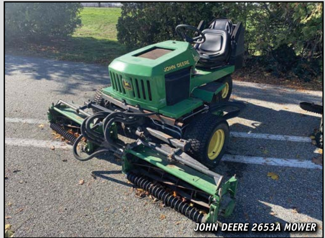
JOHN DEERE 2653A MOWER