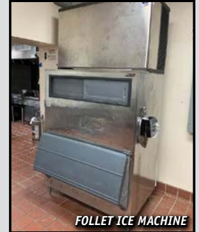
FOLLETT ICE MACHINE