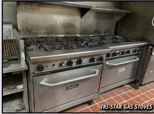
TRI-STAR GAS STOVES