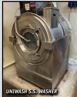
UNIWASH S.S. WASHER