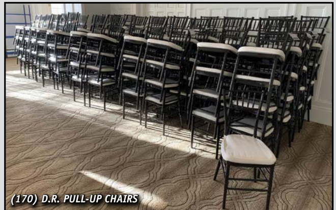
(170) D.R. PULL-UP CHAIRS