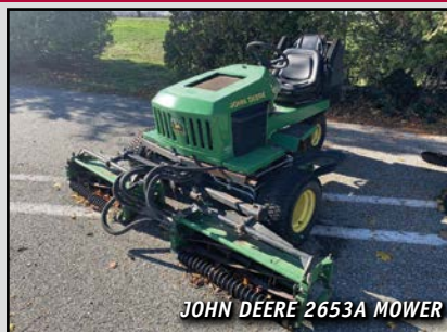
JOHN DEERE 2653A MOWER