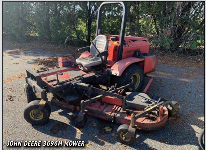
JOHN DEERE 3696M MOWER