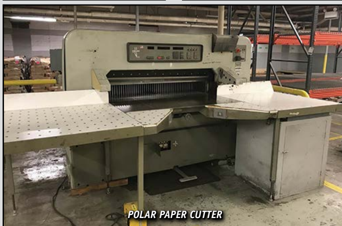
POLAR PAPER CUTTER