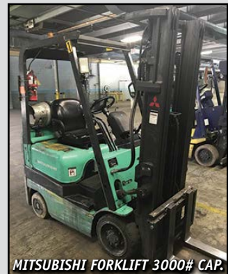
MITSUBISHI FORKLIFT 3000# CAP.