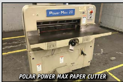
POLAR POWER MAX PAPER CUTTER