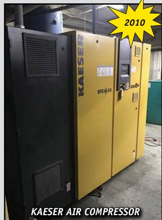
KAESER AIR COMPRESSOR