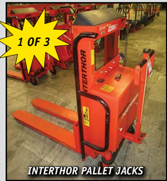
INTERTHOR PALLET JACKS