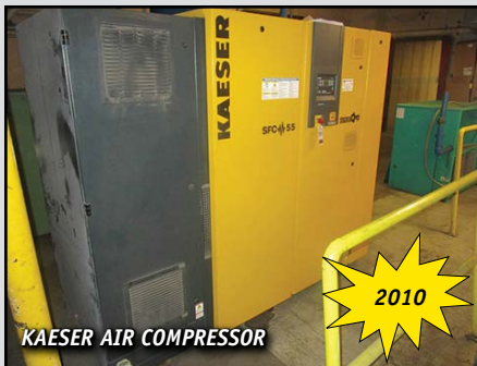
KAESER AIR COMPRESSOR