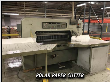
POLAR PAPER CUTTER