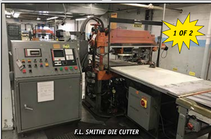
F.L. SMITHE DIE CUTTER