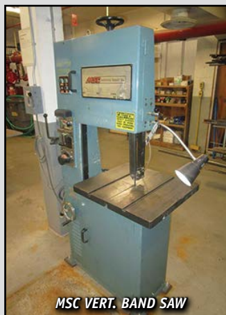
MSC VERT. BAND SAW