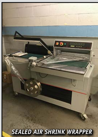
SEALED AIR SHRINK WRAPPER