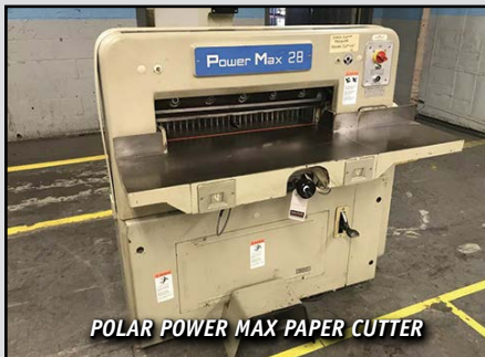
POLAR POWER MAX PAPER CUTTER

INSPECTION: MORNING OF SALE – 8:30 A.M. TO 10:30 A.M.