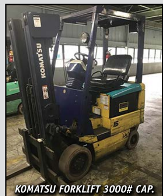
KOMATSU FORKLIFT 3000# CAP.