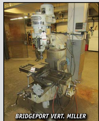
BRIDGEPORT VERT. MILLER