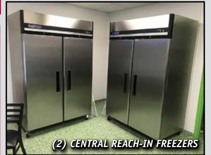
(2) CENTRAL REACH-IN FREEZERS