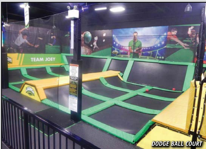
DODGE BALL COURT