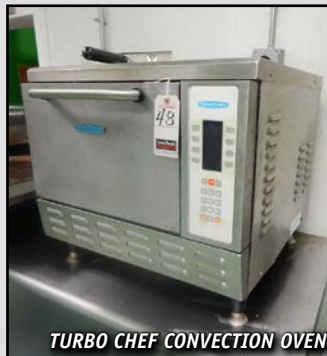
TURBO CHEF CONVECTION OVEN