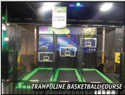
TRAMPOLINE BASKETBALL COURSE