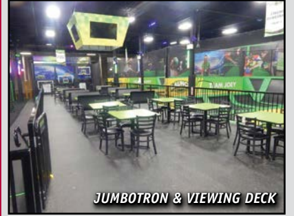
JUMBOTRON & VIEWING DECK