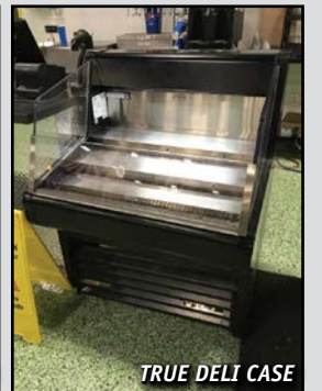
TRUE DELI CASE