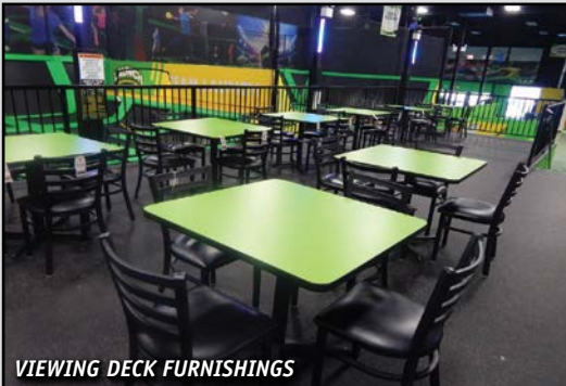
VIEWING DECK FURNISHINGS