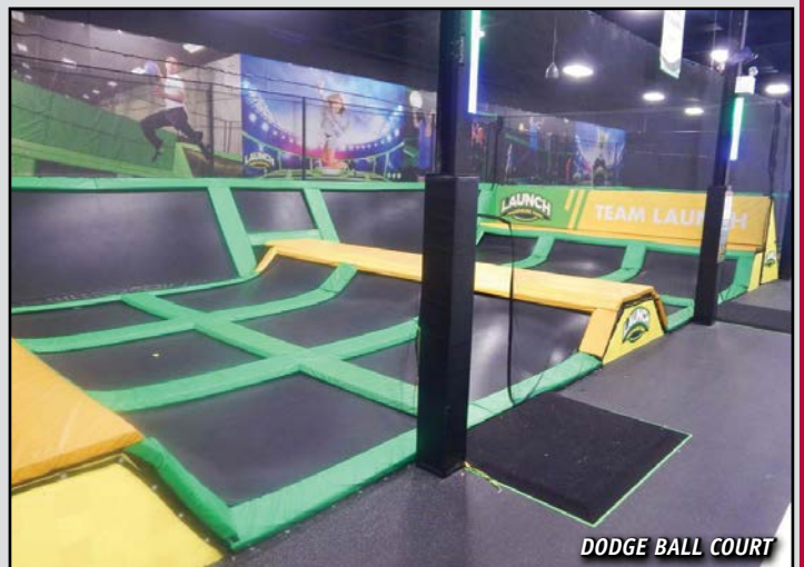
DODGE BALL COURT