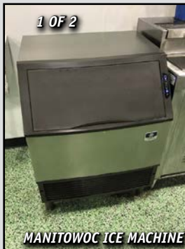
MANITOWOC ICE MACHINE