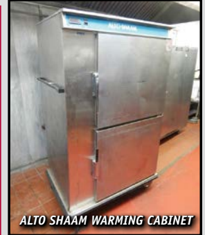
ALTO SHAAM WARMING CABINET