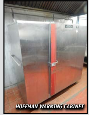
HOFFMAN WARMING CABINET