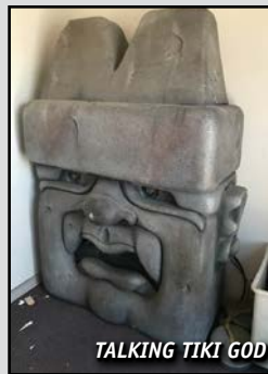
TALKING TIKI GOD