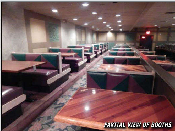
PARTIAL VIEW OF BOOTHS