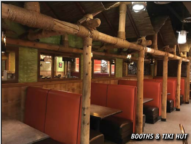
BOOTHS & TIKI HUT

INSPECTIONS: MORNING OF SALE – 8:30 A.M. TO 10:30 A.M.