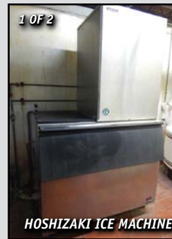
HOSHIZAKI ICE MACHINE