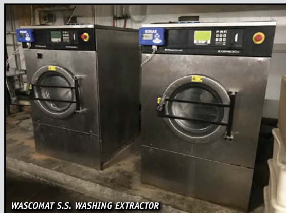
WASCOMAT S.S. WASHING EXTRACTOR