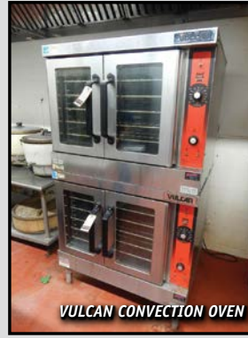
VULCAN CONVECTION OVEN