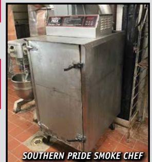
SOUTHERN PRIDE SMOKE CHEF