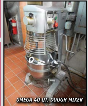
OMEGA 40 QT. DOUGH MIXER