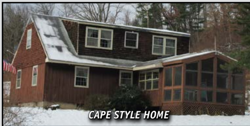
CAPE STYLE HOME