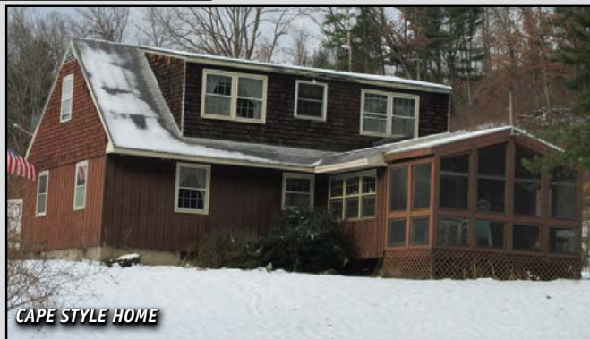
CAPE STYLE HOME