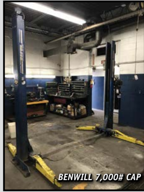
BENWILL 7,000# CAP