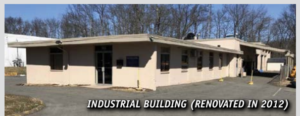
INDUSTRIAL BUILDING (RENOVATED IN 2012)