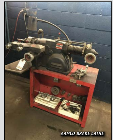
AAMCO BRAKE LATHE