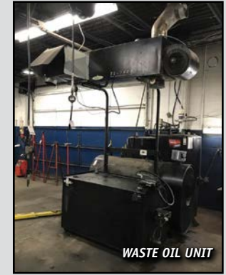
WASTE OIL UNIT