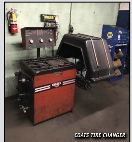
COATS TIRE CHANGER