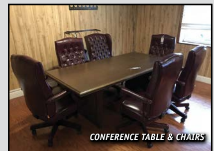
CONFERENCE TABLE & CHAIRS