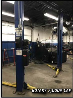
ROTARY 7,000# CAP