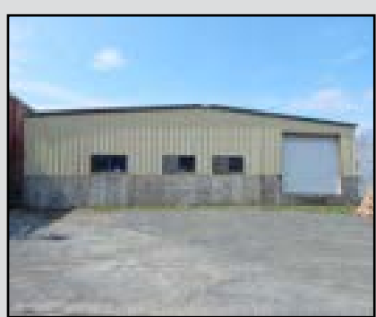
WAREHOUSE - REAR VIEW