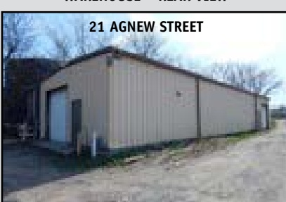
DETACHED STORAGE BUILDING