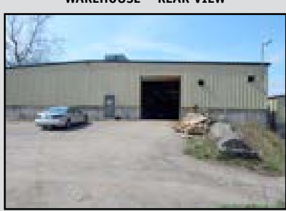
WAREHOUSE - REAR VIEW