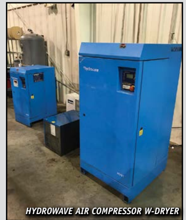
HYDROWAVE AIR COMPRESSOR W-DRYER