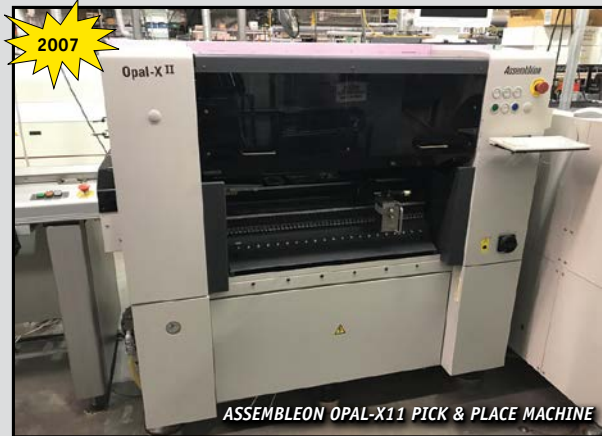
ASSEMBLEON OPAL-X11 PICK & PLACE MACHINE