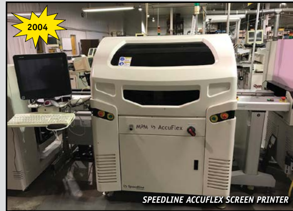
SPEEDLINE ACCUFLEX SCREEN PRINTER