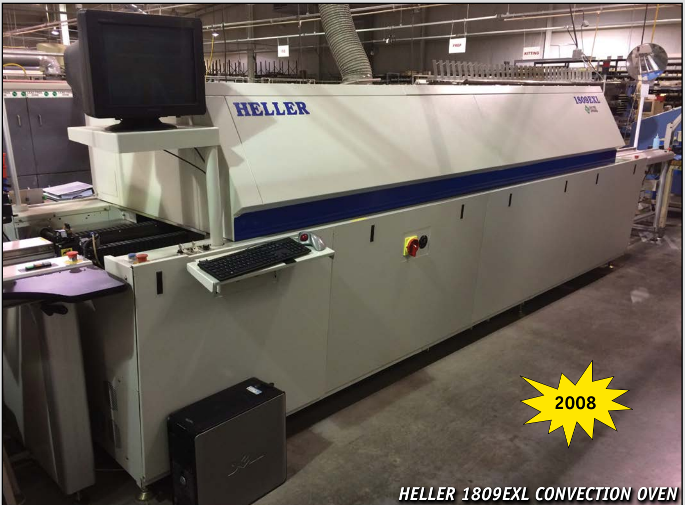
HELLER 1809EXL CONVECTION OVEN

INSPECTIONS: TUESDAY, APRIL 25 TH - 10:00 A.M. TO 4:00 P.M. & MORNING OF SALE - 8:30 A.M. TO 11:00 A.M.