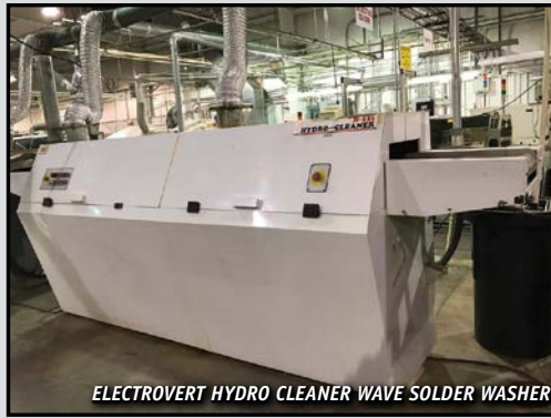
ELECTROVERT HYDRO CLEANER WAVE SOLDER WASHER