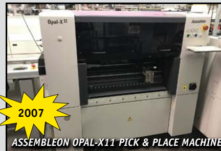
ASSEMBLEON OPAL-X11 PICK & PLACE MACHINE