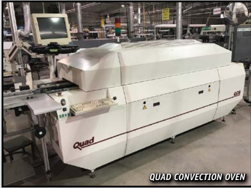
QUAD CONVECTION OVEN