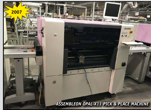
ASSEMBLEON OPAL-X11 PICK & PLACE MACHINE