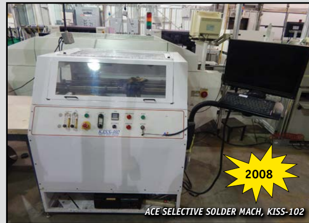
ACE SELECTIVE SOLDER MACH, KISS-102

10% BUYERS PREMIUM APPLIES ON ALL ONSITE PURCHASES 13% BUYERS PREMIUM APPLIES ON ALL ONLINE PURCHASES