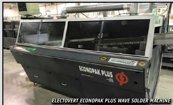
ELECTROVERT ECONOPAK PLUS WAVE SOLDER MACHINE