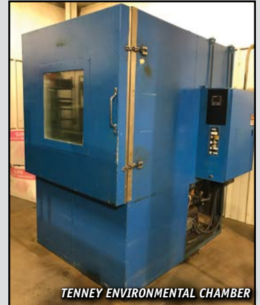
TENNEY ENVIRONMENTAL CHAMBER