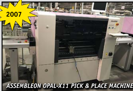
ASSEMBLEON OPAL-X11 PICK & PLACE MACHINE