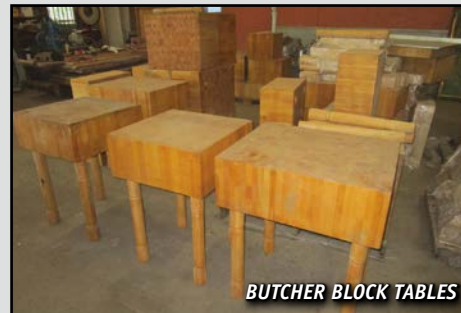
BUTCHER BLOCK TABLES