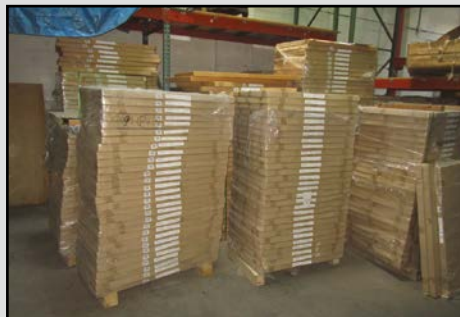
TABLE TOP INVENTORY

IMPORTANT NOTICE: THE INFORMATION DESCRIBED IN THIS BROCHURE IS CORRECT TO THE BEST OF OUR KNOWLEDGE BUT WE CANNOT GUARANTEE SAME. IT IS FOR THIS REASON THAT BUYERS SHOULD AVAIL THEMSELVES OF THE OPPORTUNITY FOR INSPECTION PRIOR TO THE SALE.