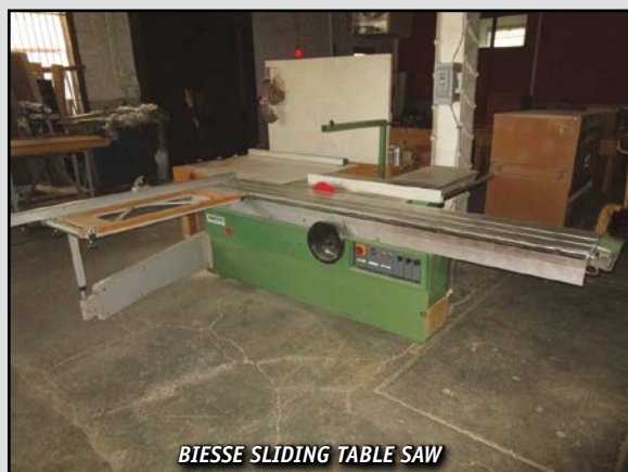
BIESSE SLIDING TABLE SAW