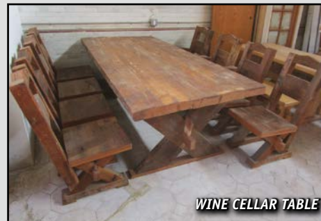
WINE CELLAR TABLE