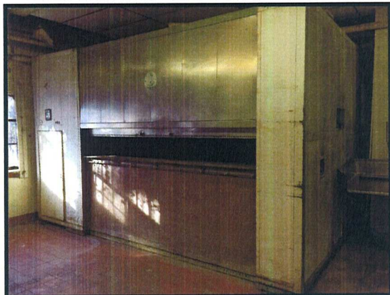
MIDDLEBY MARSHAL OVEN

2% BROKER'S INCENTIVE CALL AUCTION OFFICE FOR DETAILS