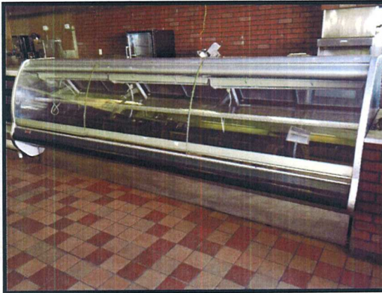
HUSSMAN 12' DELI CASE