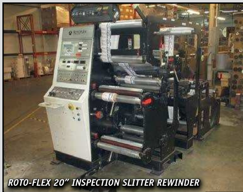
ROTO-FLEX 20" INSPECTION SLITTER REWINDER