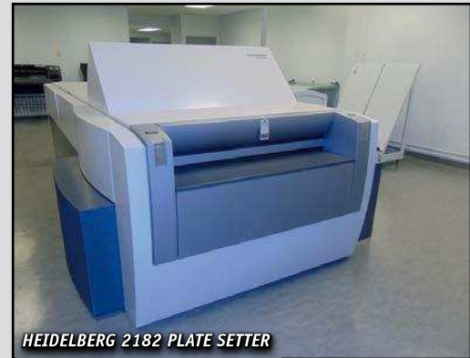
HEIDELBERG 2182 PLATE SETTER