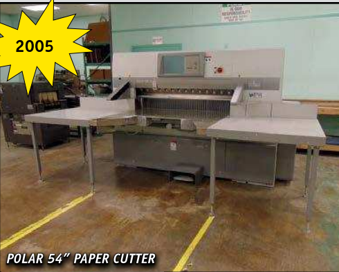
POLAR 54" PAPER CUTTER