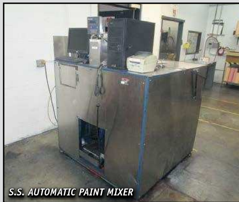
S.S. AUTOMATIC PAINT MIXER