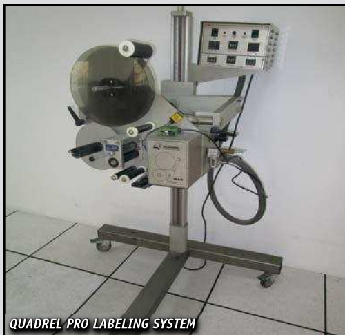
QUADREL PRO LABELING SYSTEM