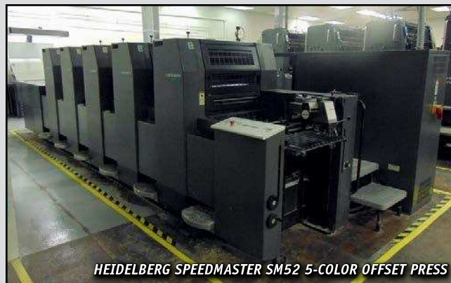
HEIDELBERG SPEEDMASTER SM52 5-COLOR OFFSET PRESS

10% BUYERS PREMIUM APPLIES ON ALL ONSITE PURCHASES 13% BUYERS PREMIUM APPLIES ON ALL ONLINE PURCHASES