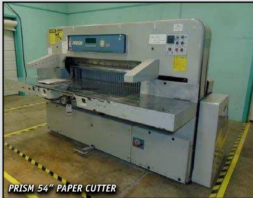
PRISM 54" PAPER CUTTER