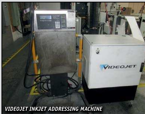
VIDEOJET INKJET ADDRESSING MACHINE