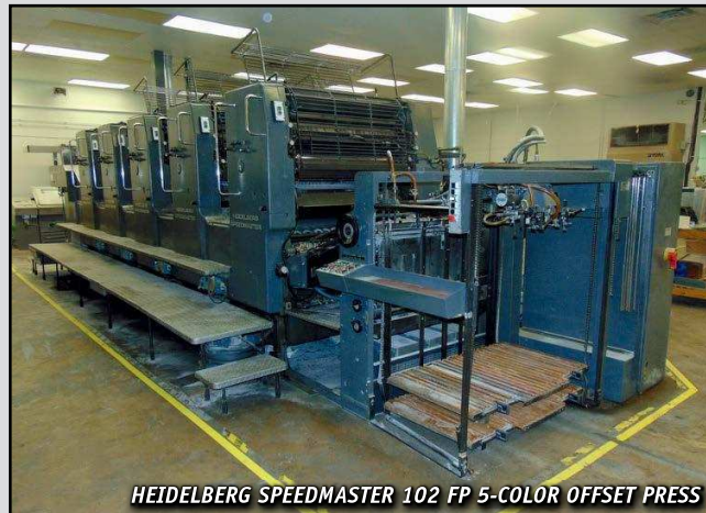
HEIDELBERG SPEEDMASTER 102 FP 5-COLOR OFFSET PRESS