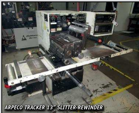
ARPECO TRACKER 13" SLITTER-REWINDER