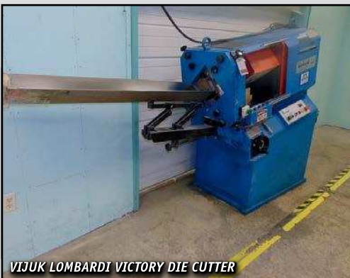
VIJUK LOMBARDI VICTORY DIE CUTTER