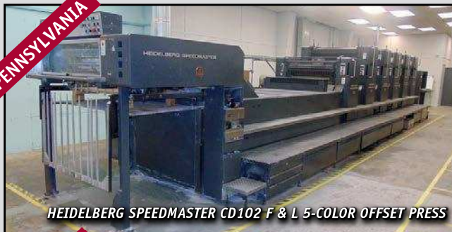
HEIDELBERG SPEEDMASTER CD102 F & L 5-COLOR OFFSET PRESS