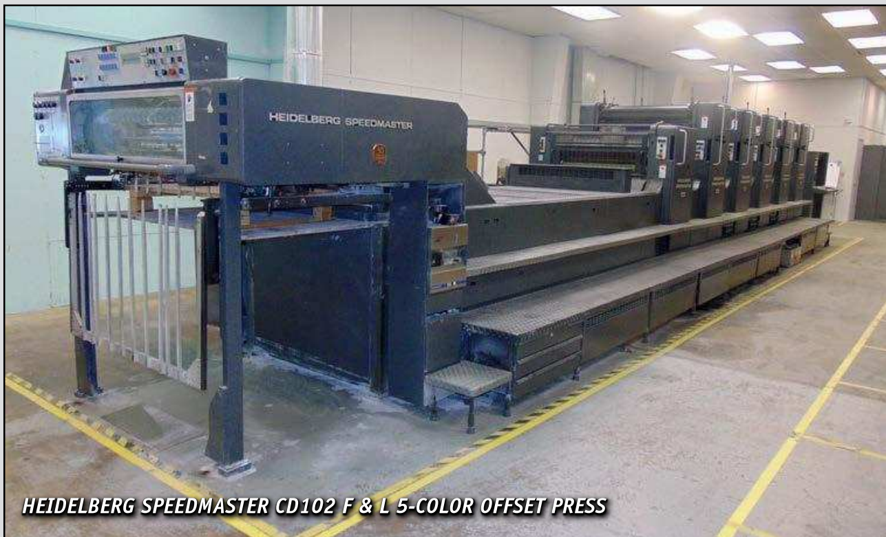
HEIDELBERG SPEEDMASTER CD102 F & L 5-COLOR OFFSET PRESS

INSPECTIONS: 10:00 A.M. TO 4:00 P.M. AT EACH LOCATION ON DAY PRIOR TO EACH SALE AND MORNING OF SALE – 8:30 A.M. TO 11:00 A.M. AT EACH LOCATION