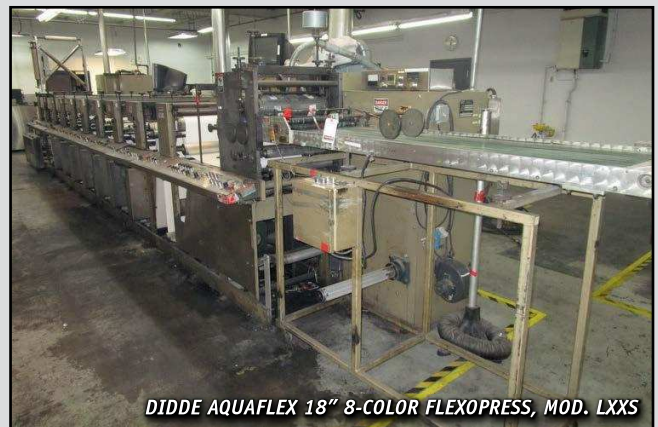
DIDDE AQUAFLEX 18" 8-COLOR FLEXOPRESS, MOD. LXXS