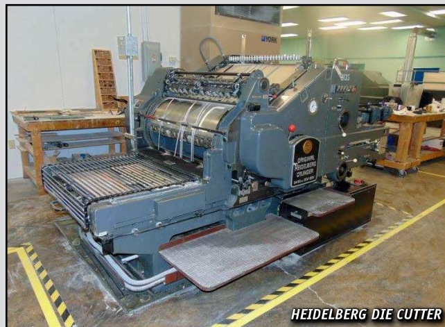
HEIDELBERG DIE CUTTER