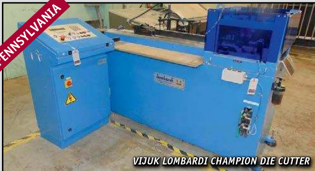
VIJUK LOMBARDI CHAMPION DIE CUTTER