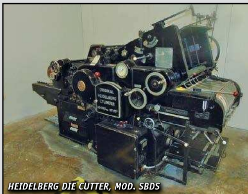
HEIDELBERG DIE CUTTER, MOD. SBDS