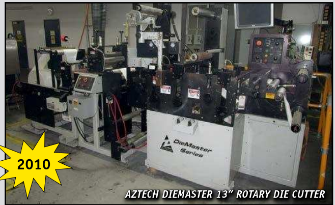
AZTECH DIEMASTER 13" ROTARY DIE CUTTER

10% BUYERS PREMIUM APPLIES ON ALL ONSITE PURCHASES 13% BUYERS PREMIUM APPLIES ON ALL ONLINE PURCHASES