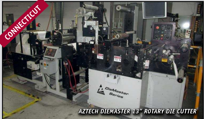
AZTECH DIEMASTER 13" ROTARY DIE CUTTER