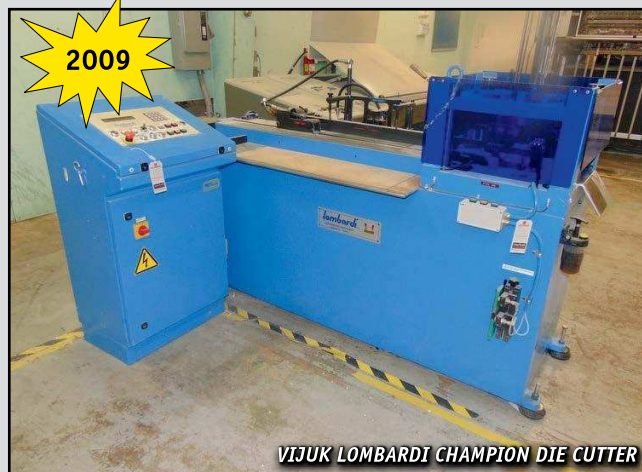
VIJUK LOMBARDI CHAMPION DIE CUTTER