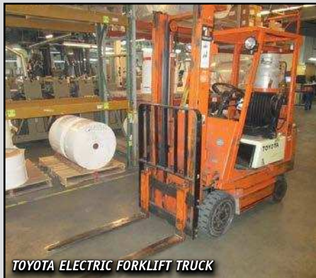
TOYOTA ELECTRIC FORKLIFT TRUCK