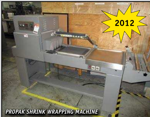
PROPAK SHRINK WRAPPING MACHINE