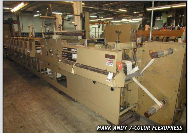
MARK ANDY 7-COLOR FLEXOPRESS