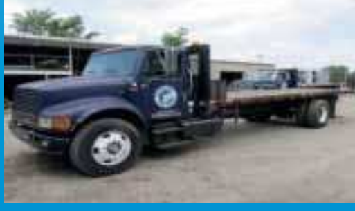
1993 Int'l 4900 w/24' Knapheide Flatbed