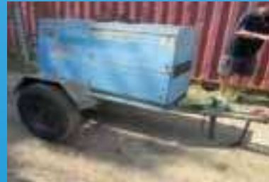
(1 of 3) Lincoln Weldanpower 250D10 Tag-Along Welder/Generators