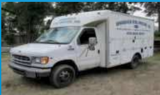
2002 Ford E350 Super Duty w/12' Supreme Corp Enclosed Utility Body