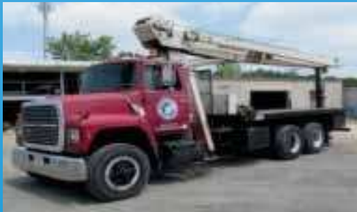
1988 Ford L8000 T/A Boom Truck w/National Series 600B Hyd Crane