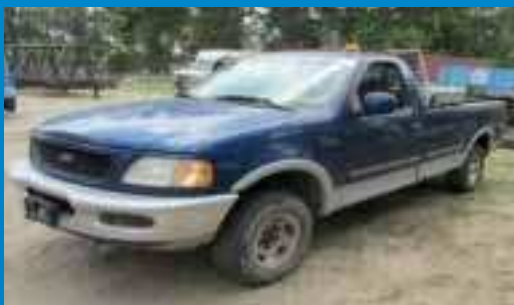
1997 Ford F150XL