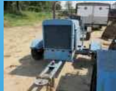
(1 of 3) Lincoln SA-200-F-163 Tag-Along Arc Welders