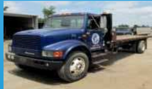
1995 Int'l 4900 w/24' Knapheide Flatbed