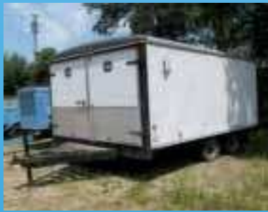
1998 Wells Cargo 12'x8' T/A Enclosed Trailer