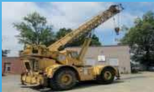
1977 Grove RT655 30 Ton R/T Crane, s/n 40113