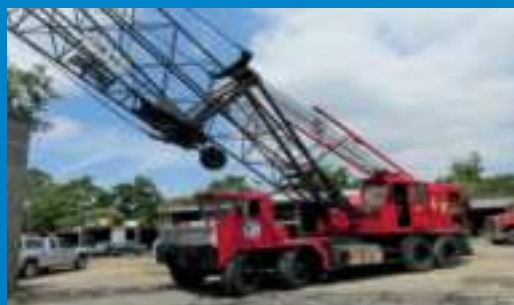
1971 Link-Belt HC218 82.5 Ton Truck Crane, s/n 18HA312