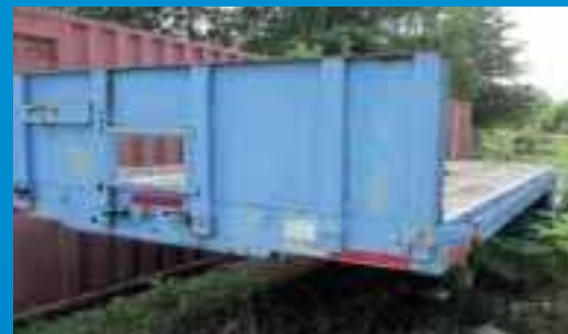
1973 Fontaine 40' T/A Step Deck Trailer