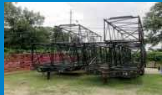
(1 of 2) 1975 Custom Built Tri-Axle Boom Trailers