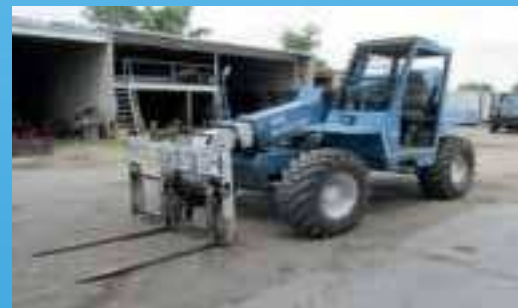
1987 Job Handler 6033 Telescopic Forklift