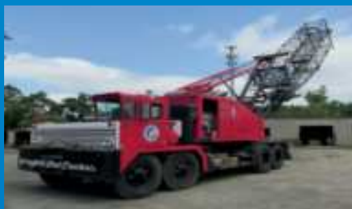
1971 Link-Belt HC218A 82.5 Ton Truck Crane, s/n 18HA327