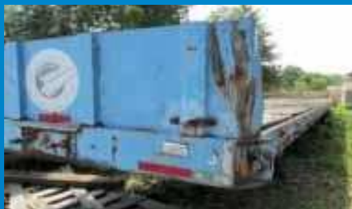
1969 Fruehauf FWJ 40' T/A Flatbed Trailer