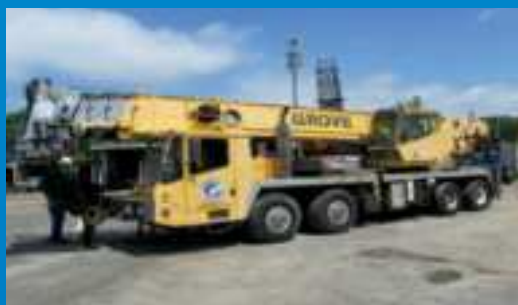
2003 Grove 870C 70 Ton Hyd Truck Crane, s/n 476S870CX3S222682