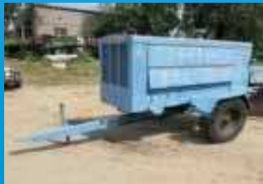
Worthington 250D Blue Brute