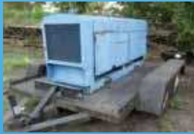
Lincoln Shield Arc SAM-400 Trailer Mtd Arc Welder