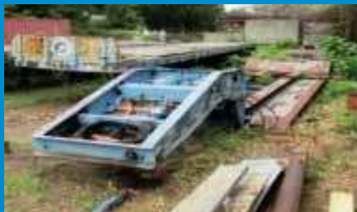
1988 Liddell-Birmingham 503HR Tri-Axle Lowboy Trailer