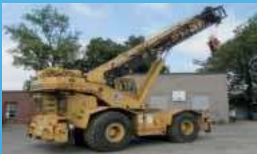
1988 Grove RT745 40 Ton R/T Crane, s/n 70313