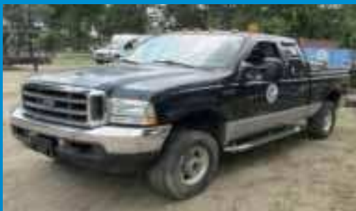
2003 Ford F250 Lariat Super Duty