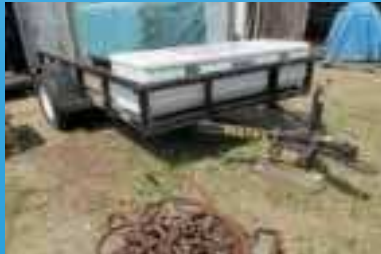
(1 of 2) 2000 Big Tex 30SA S/A Trailers