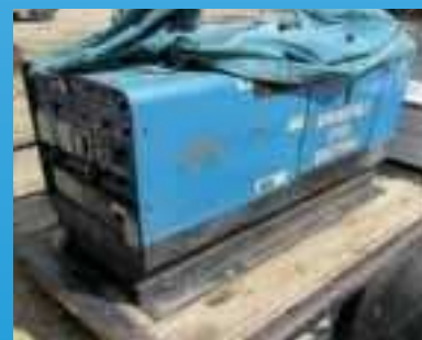
(1 of 3) 2000 Miller Pipe Pro 304 Welder/Generators