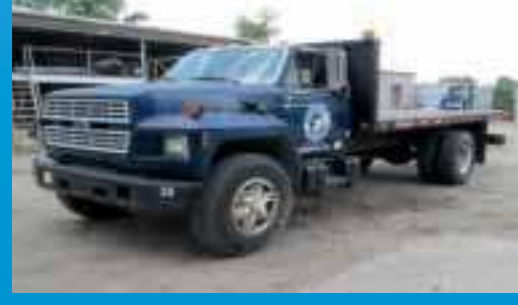
1987 Ford F700 w/18' Reading Flatbed