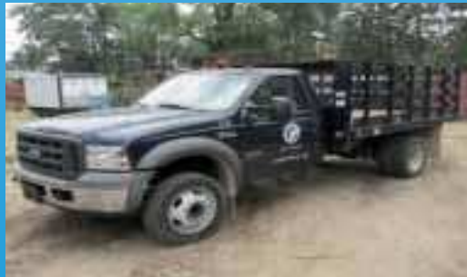
2005 Ford F450XL Super Duty w/12' Knapheide Rack Body