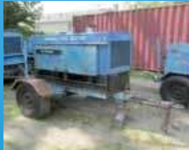
Miller Big 40 Tag-Along Welder/Generator