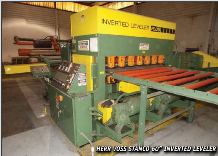
HERR VOSS STANCO 60" INVERTED LEVELER

INSPECTIONS: TUESDAY, MAY 20 TH – 10:00 A.M. TO 4:00 P.M. & MORNING OF SALE – 8:30 A.M. TO 10:00 A.M.