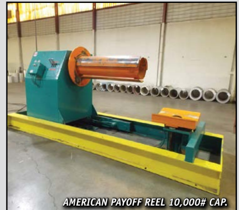
AMERICAN PAYOFF REEL 10,000# CAP.