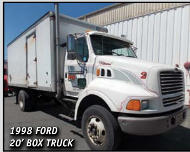
1998 FORD 20' BOX TRUCK