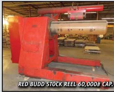
RED BUDD STOCK REEL 60,000# CAP.