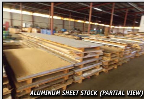
ALUMINUM SHEET STOCK (PARTIAL VIEW)