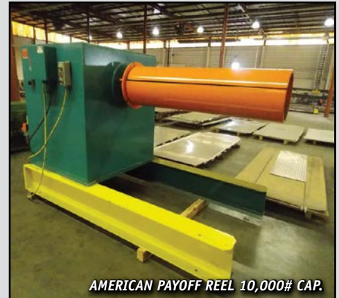
AMERICAN PAYOFF REEL 10,000# CAP.