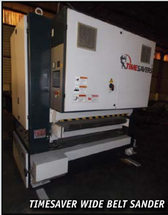
TIMESAVER WIDE BELT SANDER

10% BUYERS PREMIUM APPLIES ON ALL ONSITE PURCHASES 13% BUYERS PREMIUM APPLIES ON ALL INTERNET PURCHASES