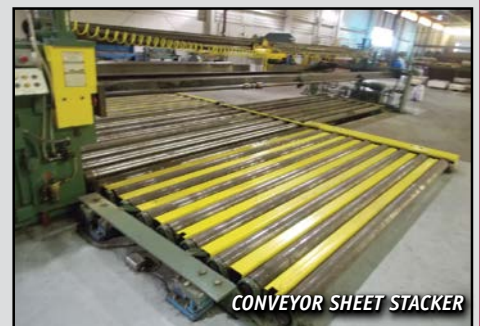
CONVEYOR SHEET STACKER