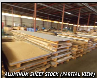
ALUMINUM SHEET STOCK (PARTIAL VIEW)