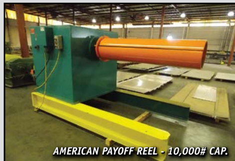
AMERICAN PAYOFF REEL - 10,000# CAP.