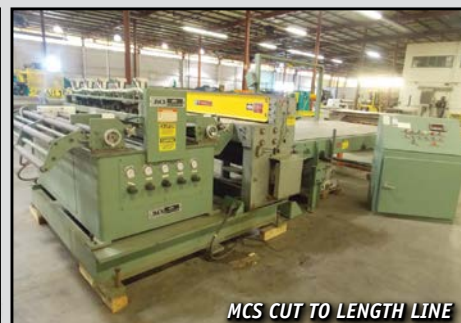
MCS CUT TO LENGTH LINE