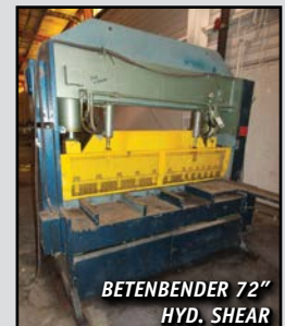
BETENBENDER 72" HYD. SHEAR