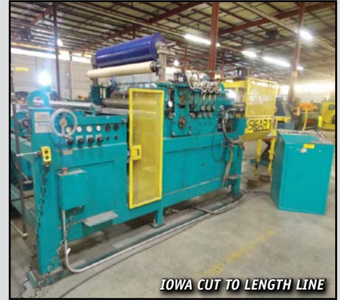
IOWA CUT TO LENGTH LINE