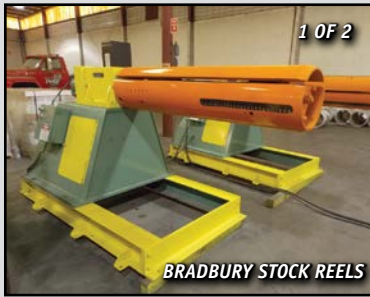
BRADBURY STOCK REELS