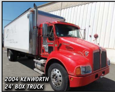
2004 KENWORTH 24' BOX TRUCK