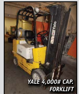
YALE 4,000# CAP. FORKLIFT