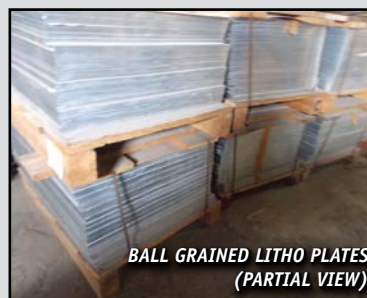
BALL GRAINED LITHO PLATES (PARTIAL VIEW)