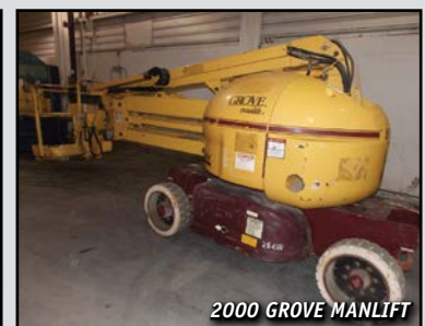
2000 GROVE MANLIFT