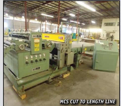
MCS CUT TO LENGTH LINE