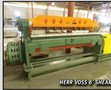
HERR VOSS 6' SHEAR