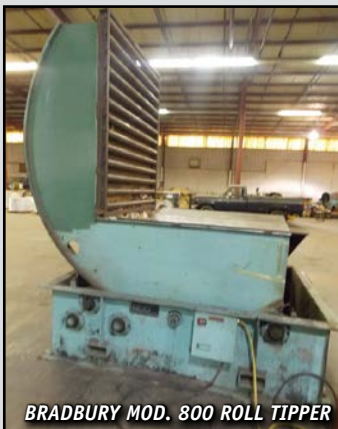
BRADBURY MOD. 800 ROLL TIPPER