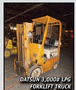
DATSUM 3,000# LPG FORKLIFT TRUCK