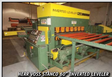
HERR VOSS STANCO 60" INVERTED LEVELER

WEDNESDAY, MAY 21 ST AT 10:00 A.M. 199 PINE STREET FLORENCE (NORTHAMPTON), MASSACHUSETTS