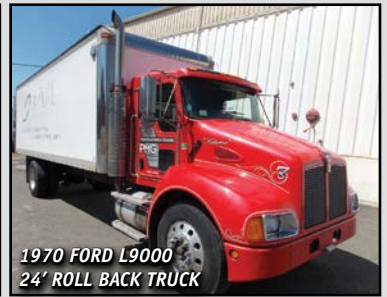
1970 FORD L9000 24' ROLL BACK TRUCK