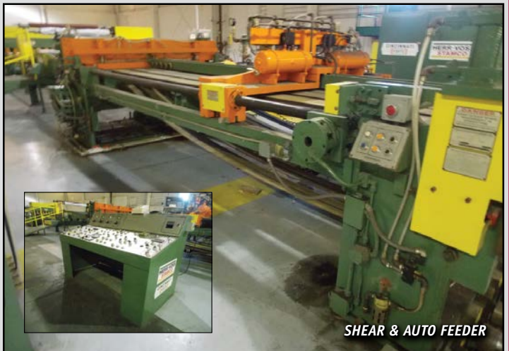
SHEAR & AUTO FEEDER