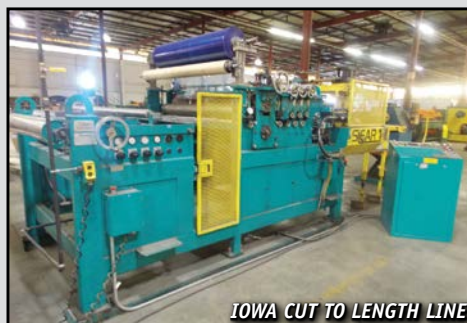
IOWA CUT TO LENGTH LINE