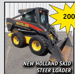
NEW HOLLAND SKID STEER LOADER