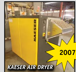
KAESER AIR DRYER