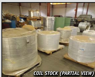
COIL STOCK (PARTIAL VIEW)