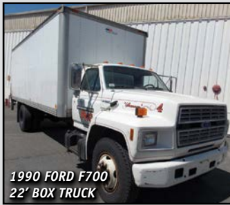
1990 FORD F700 22' BOX TRUCK