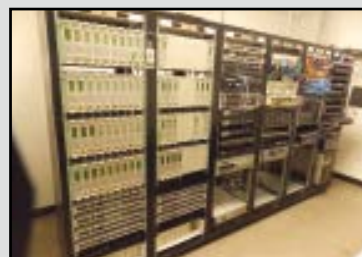
HEAD END TESTING SYSTEM