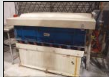
VIBRATORY PARTS FINISHER