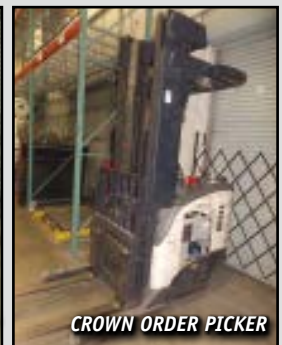
CROWN ORDER PICKER