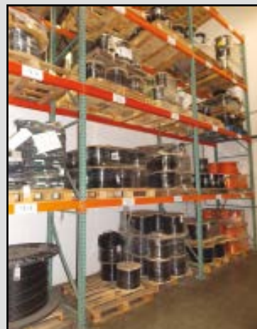
PARTIAL VIEW OF COAXIAL CABLE