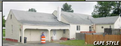
CAPE STYLE HOUSE