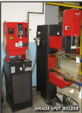
AMADA SPOT WELDER