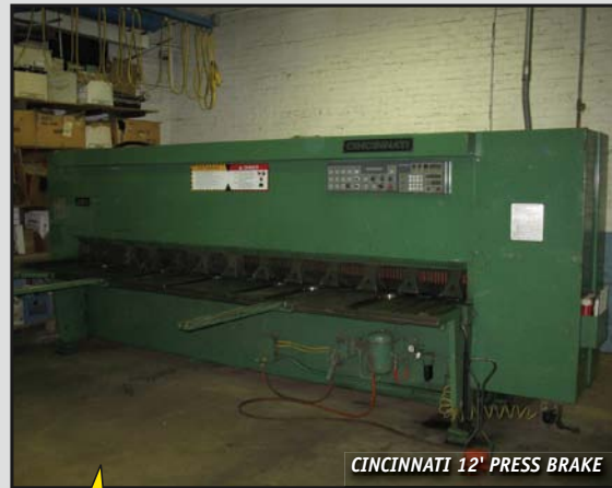
CINCINNATI 12' PRESS BRAKE