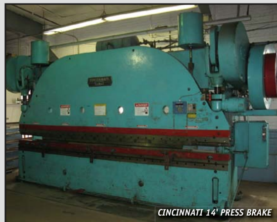
CINCINNATI 14' PRESS BRAKE