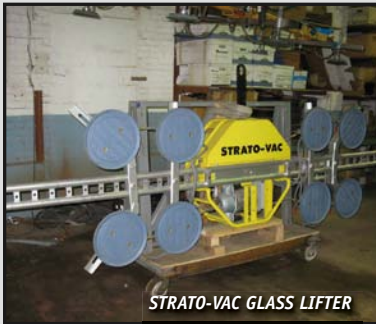
STRATO-VAC GLASS LIFTER