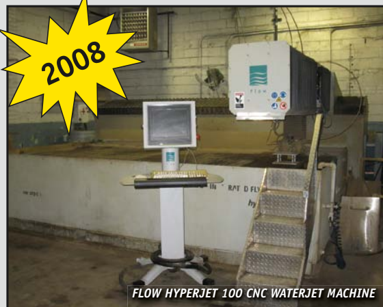
FLOW HYPERJET 100 CNC WATERJET MACHINE