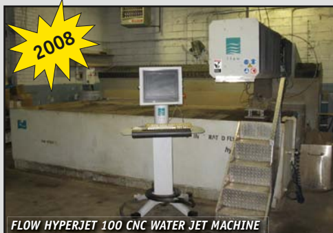
FLOW HYPERJET 100 CNC WATER JET MACHINE

THURSDAY, MAY 10 TH AT 10:30 A.M. 55-05 FLUSHING AVENUE, MASPETH (QUEENS), NEW YORK