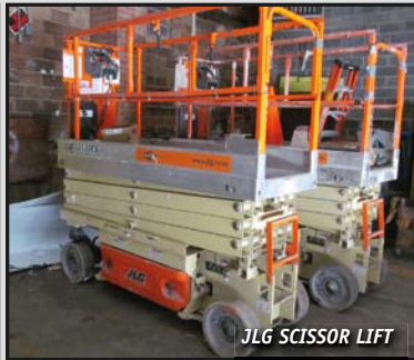
JLG SCISSOR LIFT