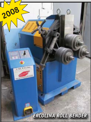
ERCOLINA ROLL BENDER