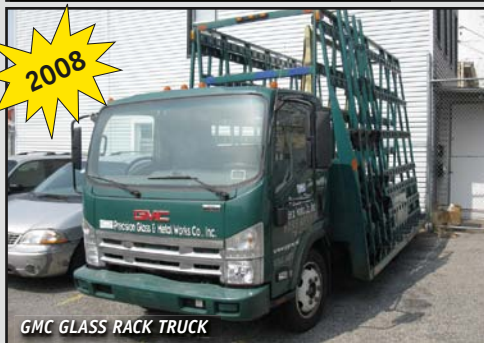
GMC GLASS RACK TRUCK