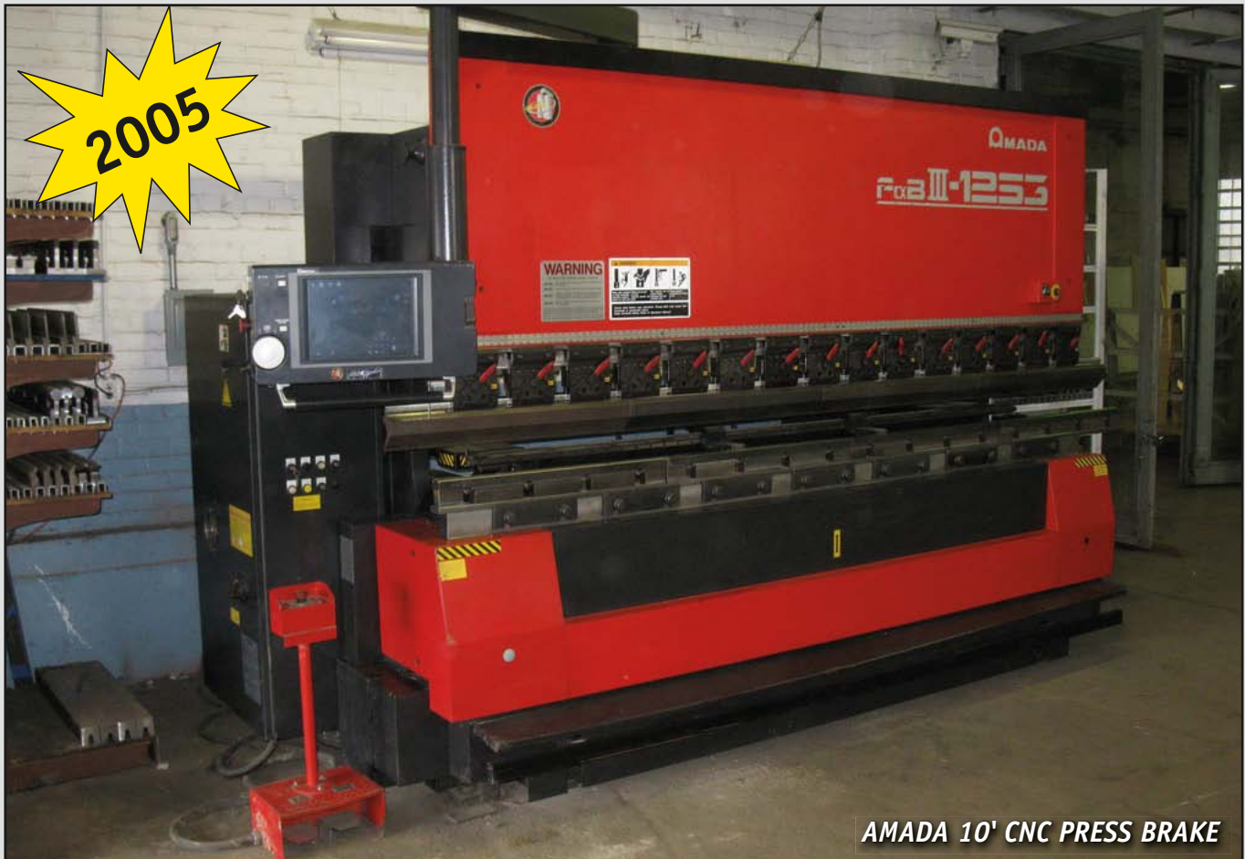
AMADA 10' CNC PRESS BRAKE

INSPECTION: WEDNESDAY, MAY 9 TH – 10:00 A.M. TO 4:00 P.M. & MORNING OF SALE – 8:30 A.M. TO 10:30 A.M.