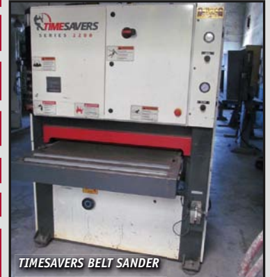
TIMESAVERS BELT SANDER