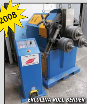
ERCOLINA ROLL BENDER