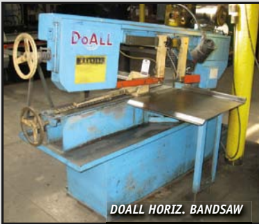
DOALL HORIZ. BANDSAW