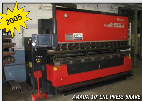
AMADA 10' CNC PRESS BRAKE