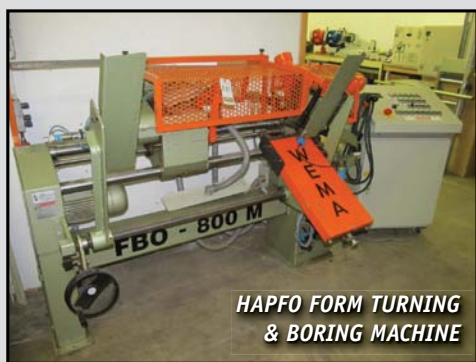
HAPFO FORM TURNING & BORING MACHINE