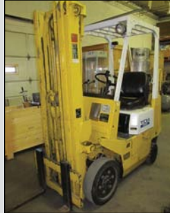
TCM Forklift 2500# Cap.

MA Auc. Lic. #161 • Est. 1932 • PA Auc. Lic. #AY000241L Toll Free 1-877-POSNIK-1 (767-6451)