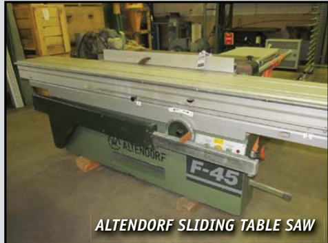
ALTENDORF SLIDING TABLE SAW