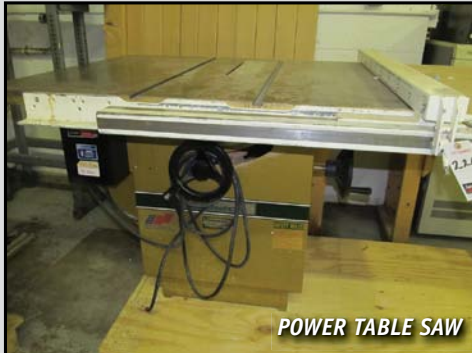
POWER TABLE SAW