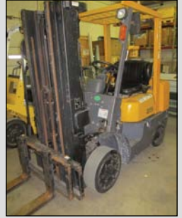
TCM Forklift 4500# Cap.

If you can't personally attend the auction sale, you don't have to miss out on the bidding. You can bid on the equipment in the following ways: