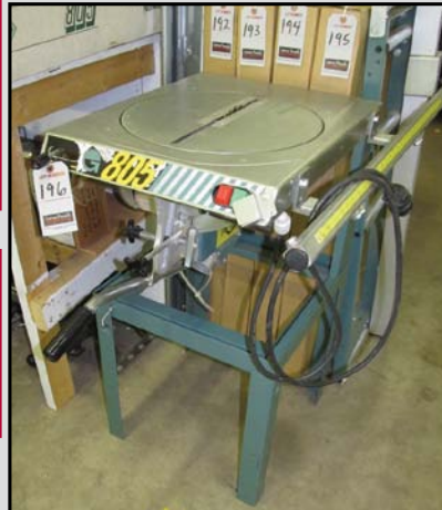
NORSAW 805 TABLE SAW