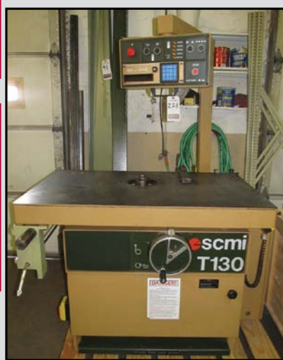
SCMI SHAPER, T130