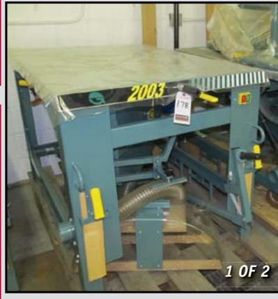
NORSAW MAXICUT 1500 TABLE SAW