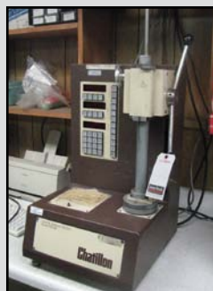
CHATILLON DIGITAL SPRING TESTER