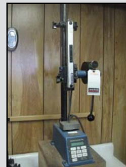
LARSON SPRING TESTER