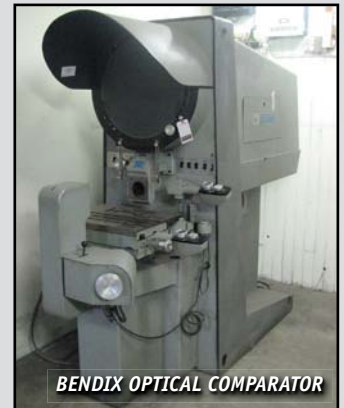
BENDIX OPTICAL COMPARATOR