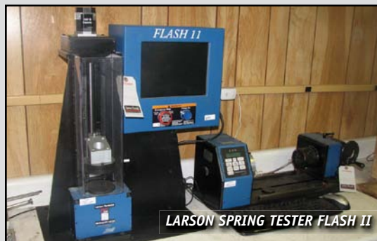
LARSON SPRING TESTER FLASH II

THE INFORMATION DESCRIBED IN THIS BROCHURE IS CORRECT TO THE BEST OF OUR KNOWLEDGE BUT WE CANNOT GUARANTEE SAME. IT IS FOR THIS REASON THAT BUYERS SHOULD AVAIL THEMSELVES OF THE OPPORTUNITY FOR INSPECTION PRIOR TO THE SALE.