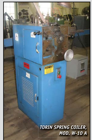
TORIN SPRING COILER, MOD. W-10 A