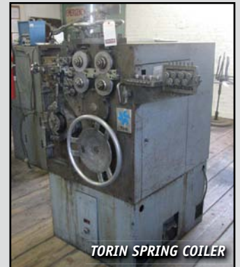
TORIN SPRING COILER