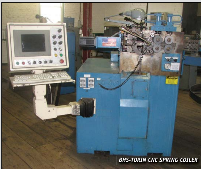
BHS-TORIN CNC SPRING COILER