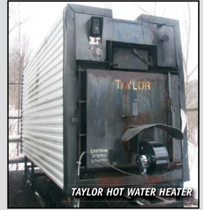
TAYLOR HOT WATER HEATER