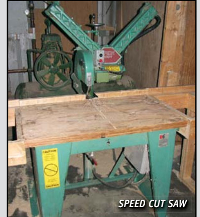
SPEED CUT SAW