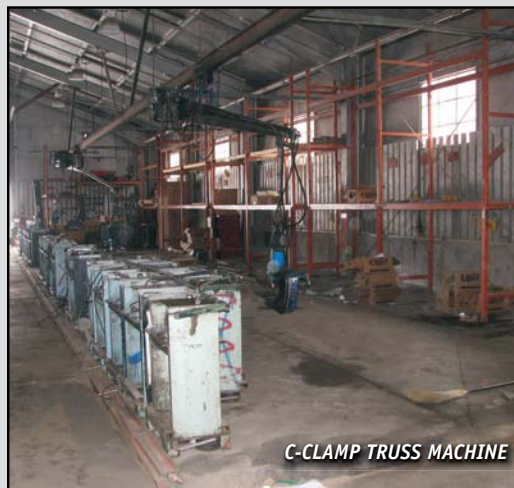
C-CLAMP TRUSS MACHINE