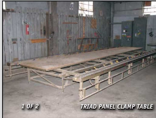
1 OF 2