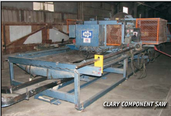
CLARY COMPONENT SAW