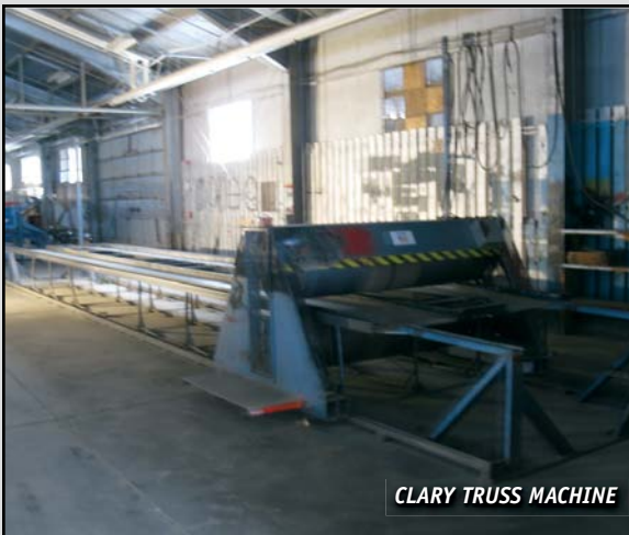
CLARY TRUSS MACHINE