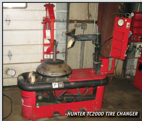
HUNTER TC2000 TIRE CHANGER