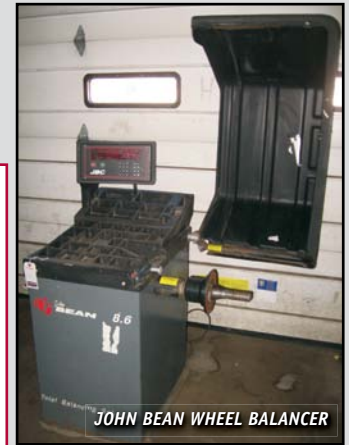
JOHN BEAN WHEEL BALANCER