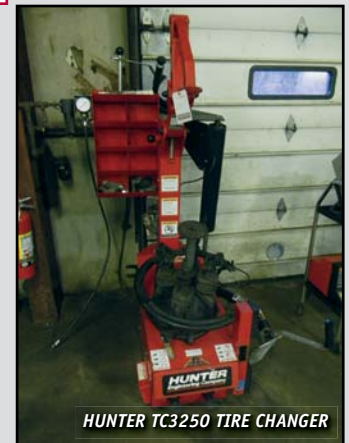
HUNTER TC3250 TIRE CHANGER