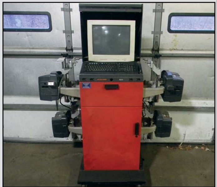
HUNTER ALIGNMENT MACHINE P211

THE INFORMATION DESCRIBED IN THIS BROCHURE IS CORRECT TO THE BEST OF OUR KNOWLEDGE BUT WE CANNOT GUARANTEE SAME. IT IS FOR THIS REASON THAT BUYERS SHOULD AVAIL THEMSELVES OF THE OPPORTUNITY FOR INSPECTION PRIOR TO THE SALE.