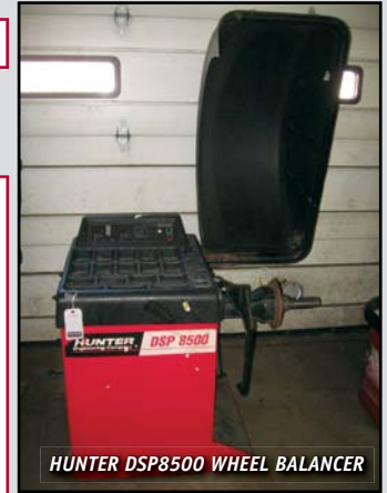
HUNTER DSP8500 WHEEL BALANCER