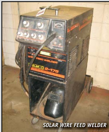
SOLAR WIRE FEED WELDER