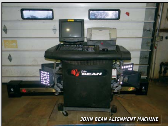
JOHN BEAN ALIGNMENT MACHINE