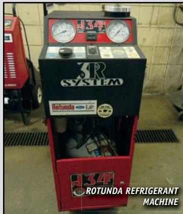
ROTUNDA REFRIGERANT MACHINE