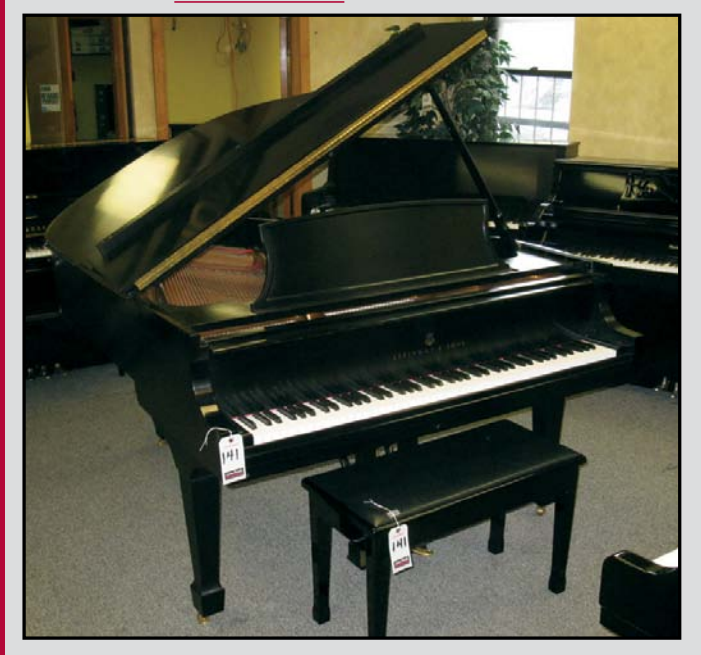
STEINWAY BABY GRAND PIANO

INSPECTION: MORNING OF SALE – STARTING AT 8:30 A.M. AT EACH LOCATION