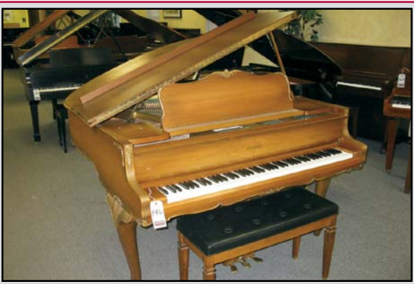
SCHIMMEL-BRAUNSCHWEIG BABY GRAND PIANO