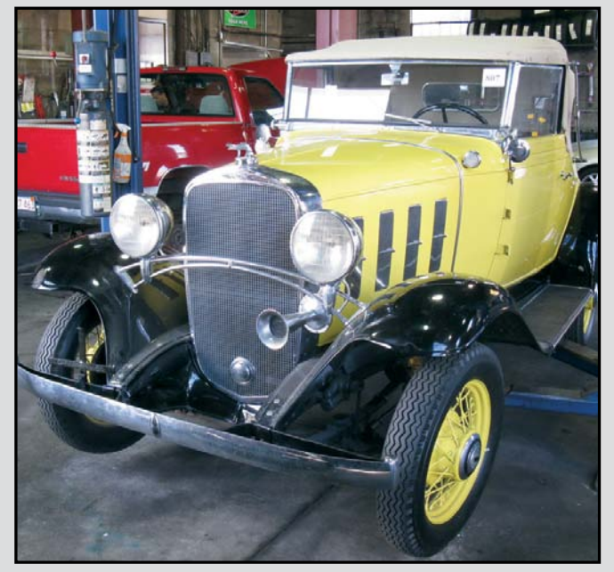
1932 CHEVROLET CABRIOLET