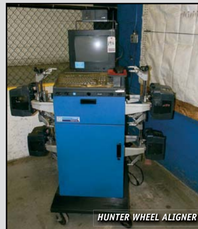
HUNTER WHEEL ALIGNER