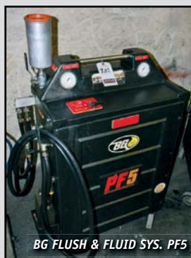
BG FLUSH &amp; FLUID SYS. PF5