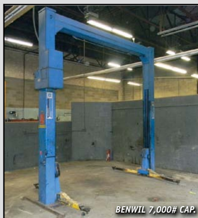
BENWIL 7,000# CAP.