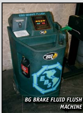
BG BRAKE FLUID FLUSH MACHINE