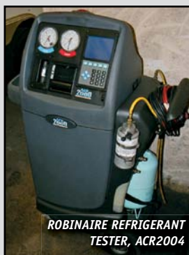
ROBINAIRE REFRIGERANT TESTER, ACR2004