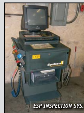
ESP INSPECTION SYS.