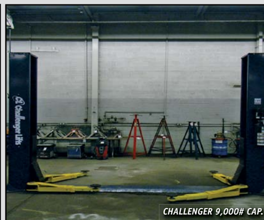
CHALLENGER 9,000# CAP.