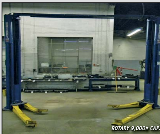
ROTARY 9,000# CAP.