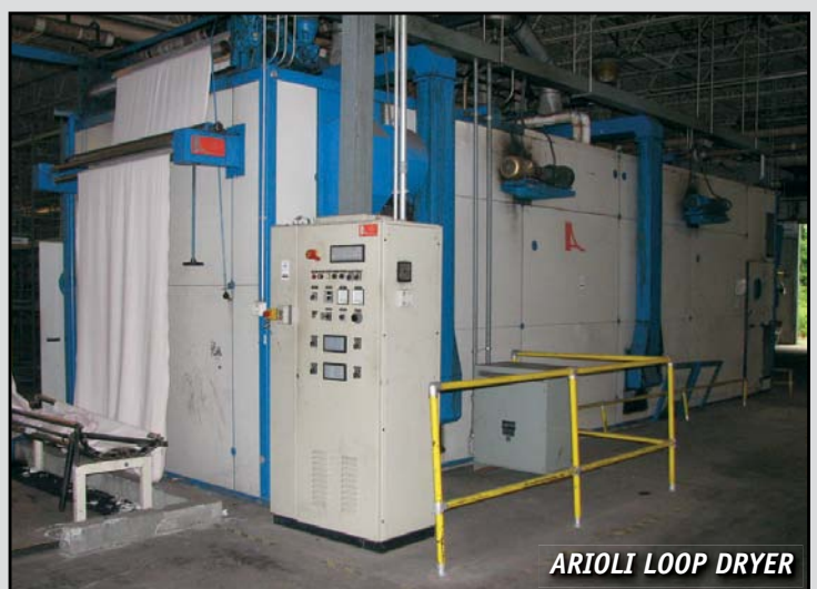
ARIOLI LOOP DRYER