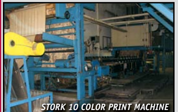
STORK 10 COLOR PRINT MACHINE