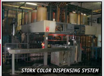
STORK COLOR DISPENSING SYSTEM