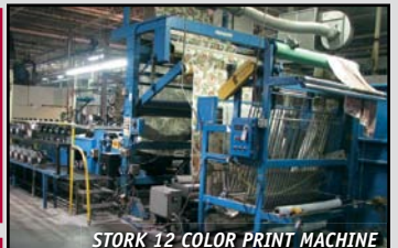
STORK 12 COLOR PRINT MACHINE