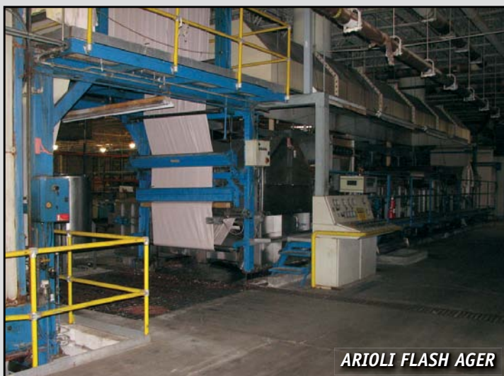
ARIOLI FLASH AGER