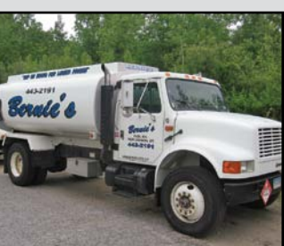
1992 IH 4900