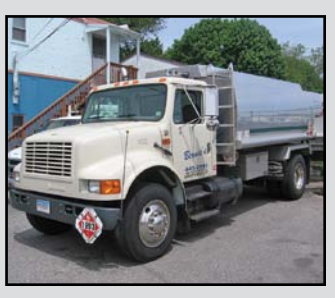
1995 IH 4900