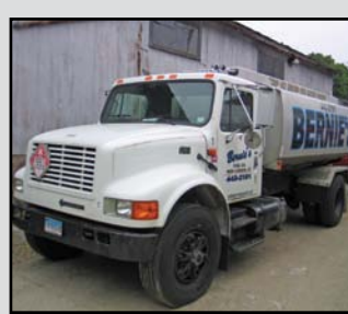
1995 IH 4900