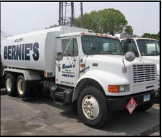
1997 IH 4900