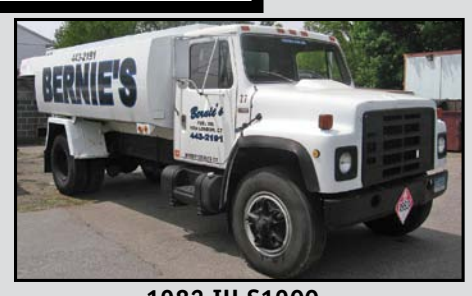
1987 IH S1900