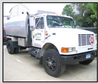
1999 IH 4900