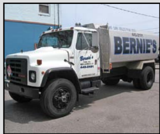
1989 IH S1900