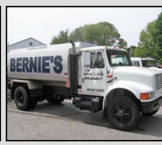
1991 IH 4900