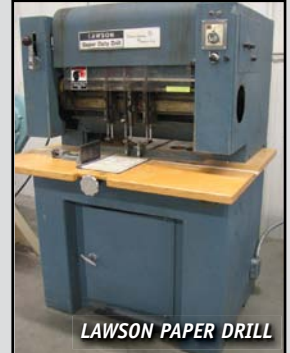
LAWSON PAPER DRILL