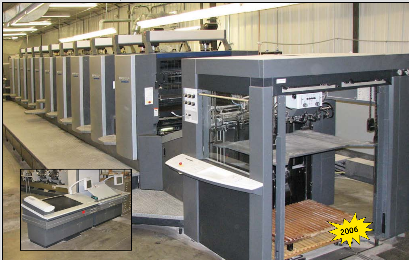
2006 HEIDELBERG SPEEDMASTER 10 COLOR OFFSET PRESS

INSPECTIONS: : WEDNESDAY, FEBRUARY 3 RD - 10:00 A.M. TO 4:00 P.M. & MORNING OF SALE - 8:30 A.M TO 10:30 A.M.