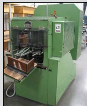
RENZ WIRE INSERTER