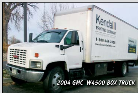
2004 GMC W4500 BOX TRUCK