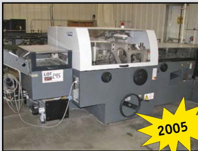
HEIDELBERG ST350 STITCHMASTER