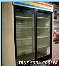
TRUE SODA COOLER