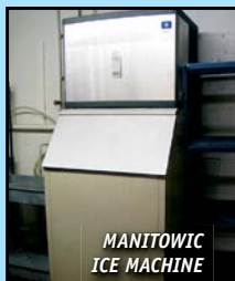
MANITOWIC ICE MACHINE