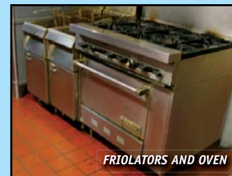
FRIOLATORS AND OVEN