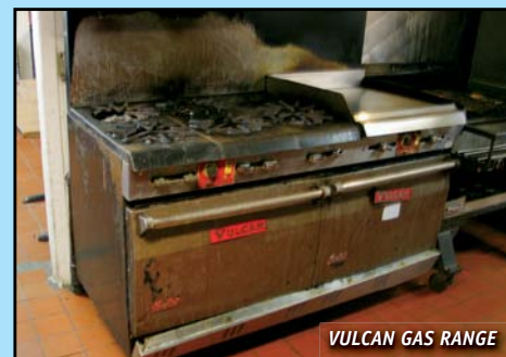
VULCAN GAS RANGE