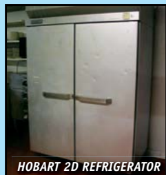
HOBART 2D REFRIGERATOR

ALL ALCOHOLIC BEVERAGE LICENSE TOGETHER WITH THE GOODWILL ATTRIBUTABLE THERETO-SOLD SUBJECT TO TRANSFER AND APPROVAL BY THE A.B.C.C. AND THE TOWN OF SOUTH HADLEY, MASSACHUSETTS LICENSING COMMISSION.