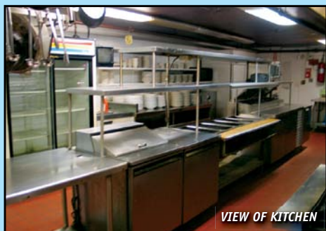
VIEW OF KITCHEN