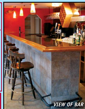
VIEW OF BAR

ALL ALCOHOLIC BEVERAGE LICENSE TOGETHER WITH THE GOODWILL ATTRIBUTABLE THERETO-SOLD SUBJECT TO TRANSFER AND APPROVAL BY THE A.B.C.C. AND THE TOWN OF SOUTH HADLEY, MASSACHUSETTS LICENSING COMMISSION.