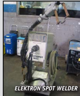
ELEKTRON SPOT WELDER