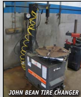
JOHN BEAN TIRE CHANGER