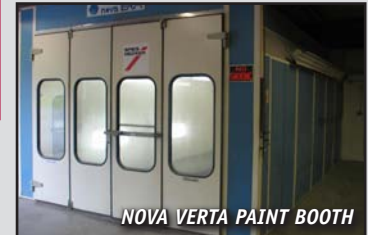
NOVA VERTA PAINT BOOTH