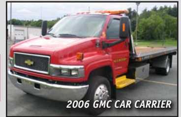
2006 GMC CAR CARRIER