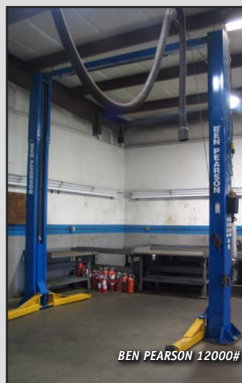
BEN PEARSON 12000#