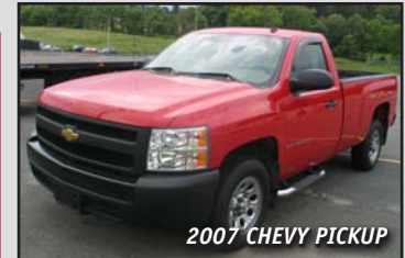
2007 CHEVY PICKUP