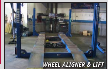
WHEEL ALIGNER & LIFT