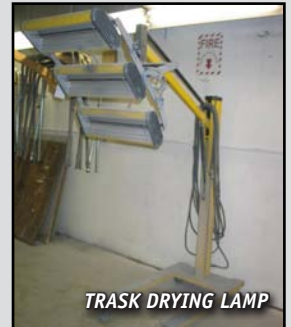
TRASK DRYING LAMP