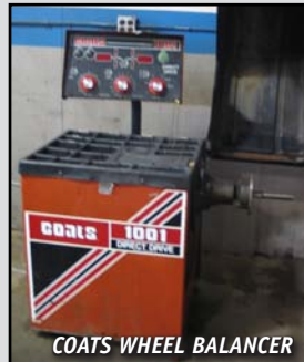
COATS WHEEL BALANCER