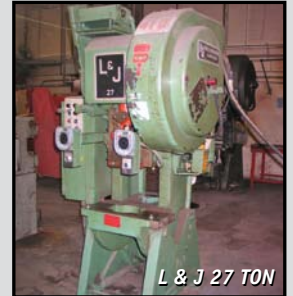
L & J 27 TON