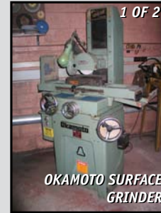
OKAMOTO SURFACE GRINDER