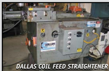
DALLAS COIL FEED STRAIGHTENER