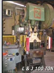
L & J 100 TON