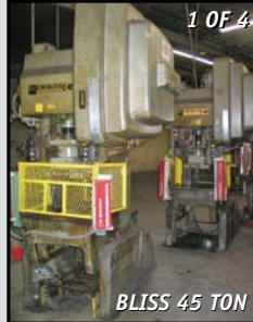
BLISS 45 TON