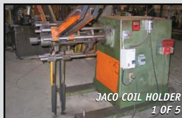
JACO COIL HOLDER 1 OF 5