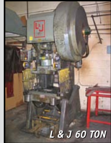
L & J 60 TON