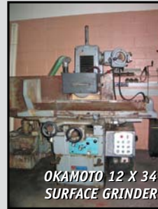
OKAMOTO 12 X 34 SURFACE GRINDER