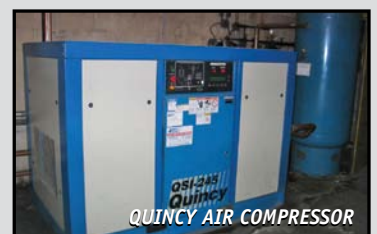
QUINCY AIR COMPRESSOR