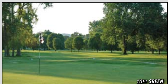
10 TH GREEN