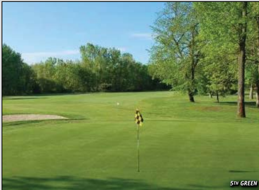
5 TH GREEN