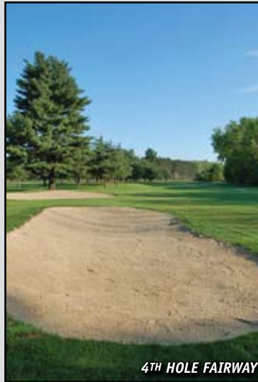
4 TH HOLE FAIRWAY