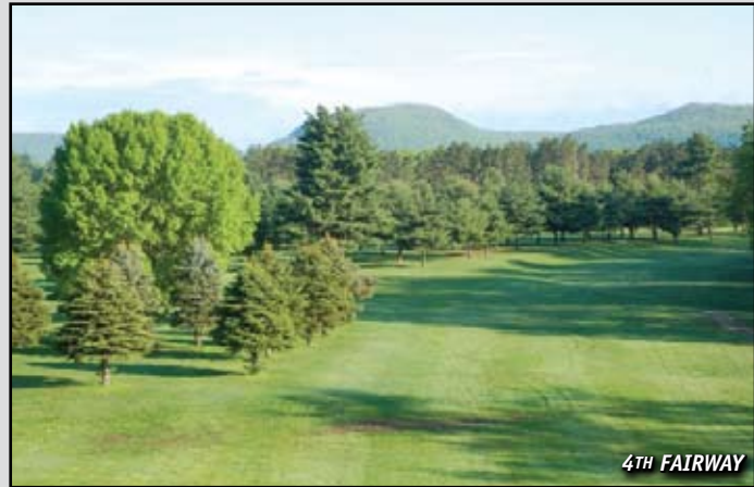
4 TH FAIRWAY