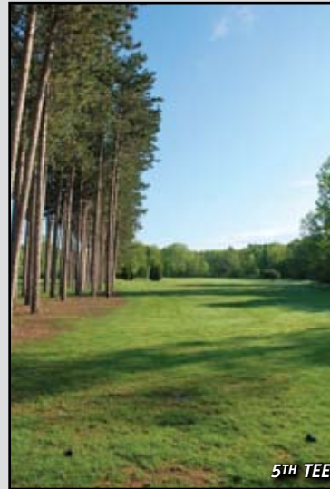
5 TH TEE