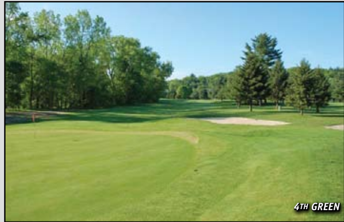
4 TH GREEN