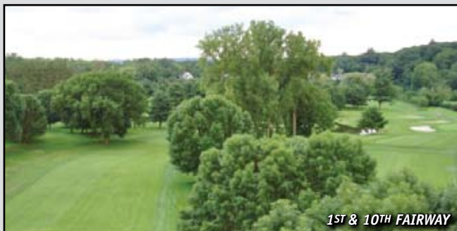
1 ST & 10 TH FAIRWAY