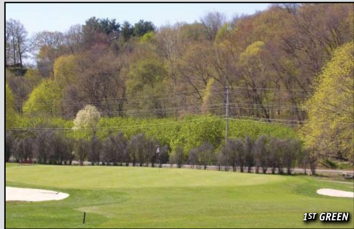
1 ST GREEN

Sale Per Order of Mortgagee & Secured Party DOHERTY, WALLACE, PILLSBURY & MURPHY, P.C. 1414 Main Street, Springfield, Ma Attorneys for Mortgagee & Secured Party