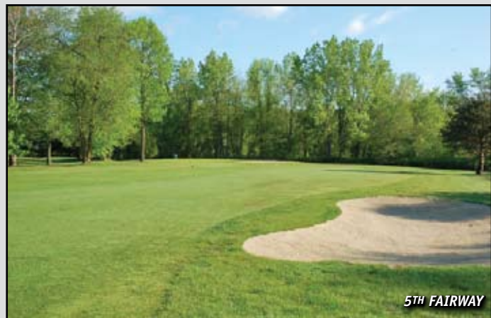
5 TH FAIRWAY