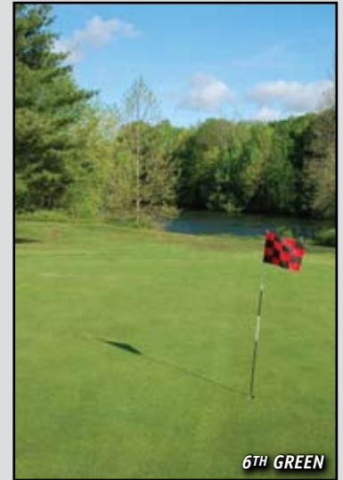
6 TH GREEN