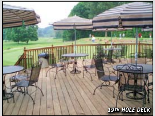
19TH HOLE DECK

SEND for COMPLETE DETAILED BIDDERS INFORMATIONAL PACKAGE OR VISIT OUR WEBSITE AT www.posnik.com