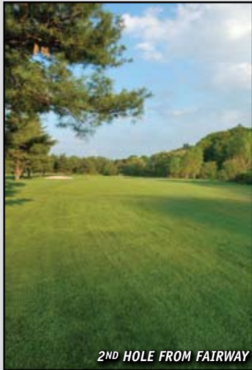
2 ND HOLE FROM FAIRWAY