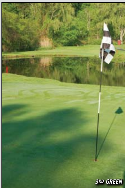
3 RD GREEN

INSPECTIONS: SAT., MARCH 21 ST ; SAT., MARCH 28 TH ; WED., APRIL 1 ST – 10:00 A.M. TO 3:00 P.M. & MORNING OF SALE – 8:30 A.M TO 11:00 A.M. OR UPON REQUEST