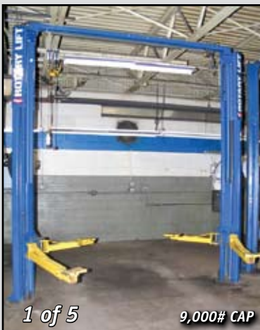
1 of 5