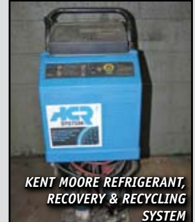
KENT MOORE REFRIGERANT, RECOVERY & RECYCLING SYSTEM