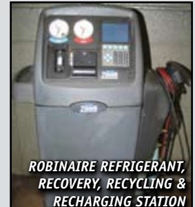
ROBINAIR REFRIGERANT, RECOVERY, RECYCLING & RECHARGING STATION