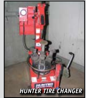
HUNTER TIRE CHANGER