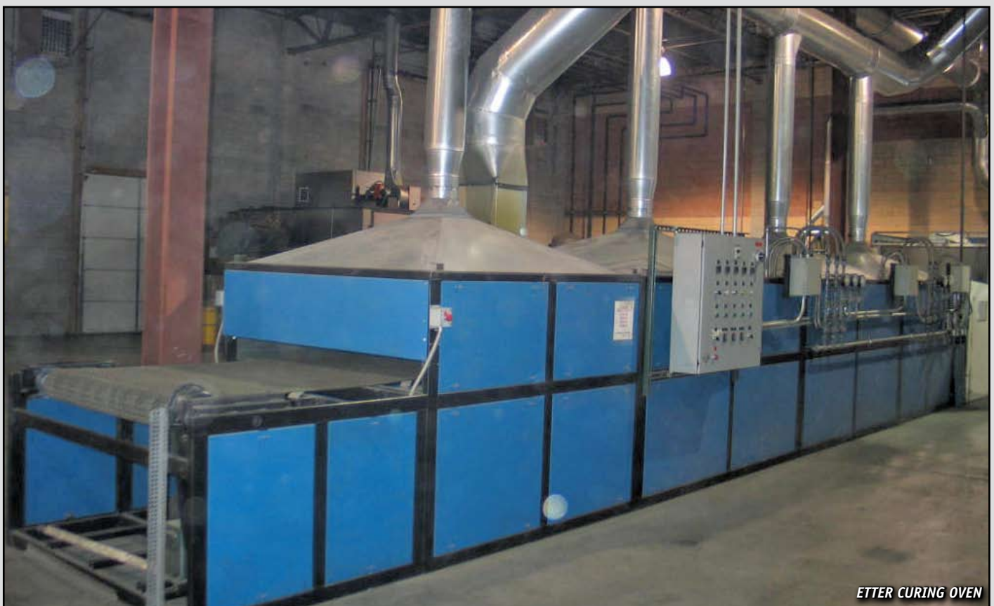
ETTER CURING OVEN