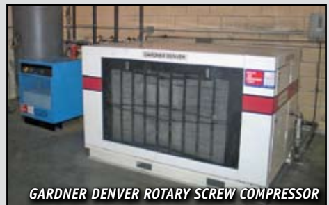
GARDNER DENVER ROTARY SCREW COMPRESSOR