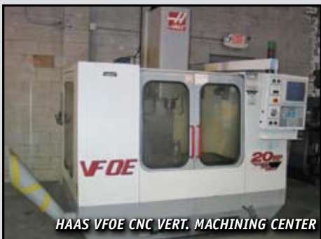
HAAS VFOE CNC VERT. MACHINING CENTER