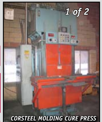
CORSTEEL MOLDING CURE PRESS