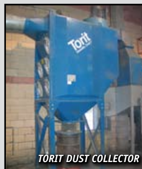
TORIT DUST COLLECTOR