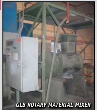
GLB ROTARY MATERIAL MIXER