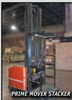
PRIME MOVER STACKER