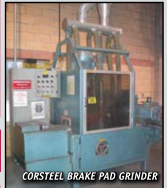
CORSTEEL BRAKE PAD GRINDER