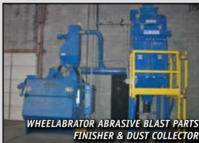
WHEELABRATOR ABRASIVE BLAST PARTS FINISHER & DUST COLLECTOR