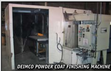
DEIMCO POWDER COAT FINISHING MACHINE