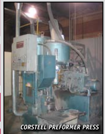
CORSTEEL PERFORMER PRESS