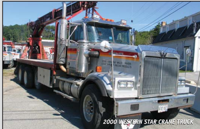
2000 WESTERN STAR CRANE TRUCK