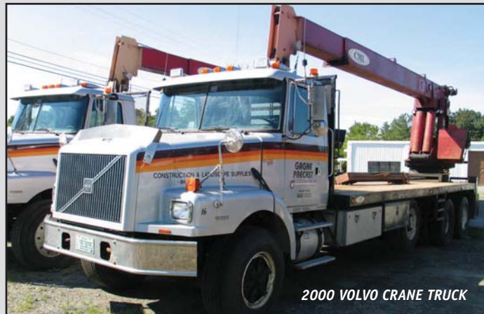
2000 VOLVO CRANE TRUCK