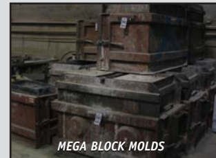
MEGA BLOCK MOLDS