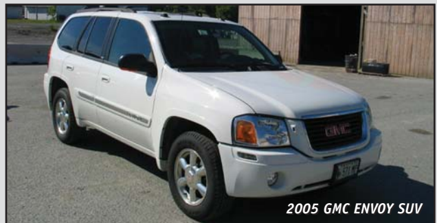
2005 GMC ENVOY SUV

Aaron Posnik & Co., Inc. 5 Great Valley Parkway, Suite 244 • Malvern, (Philadelphia) PA 19003 (610) 853-6655 (Fax) 583-6633