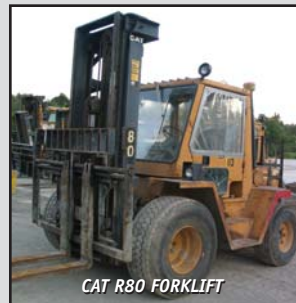
CAT R80 FORKLIFT