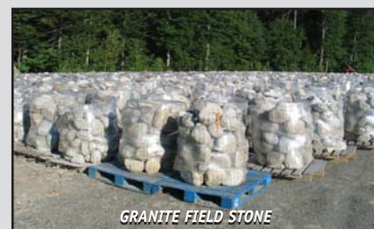
GRANITE FIELD STONE