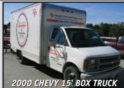
2000 CHEVY 15' BOX TRUCK