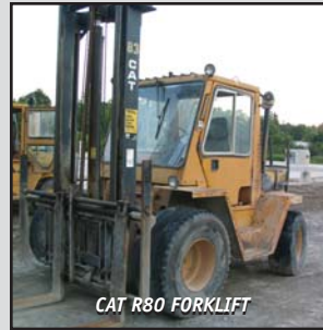
CAT R80 FORKLIFT