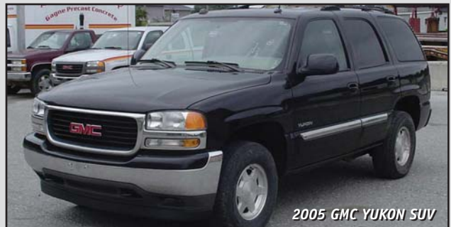
2005 GMC YUKON SUV