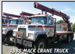
1985 MACK CRANE TRUCK