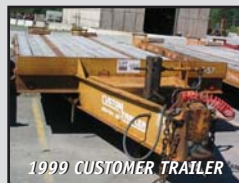
1999 CUSTOMER TRAILER