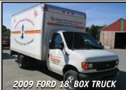
2009 FORD 18' BOX TRUCK