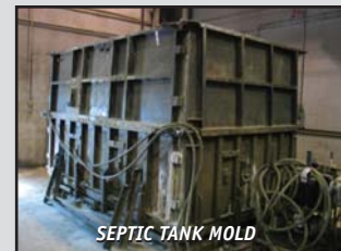
SEPTIC TANK MOLD