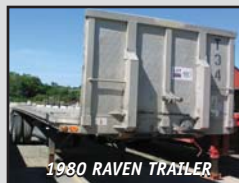
1980 RAVEN TRAILER