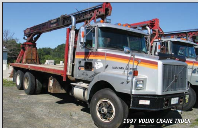
1997 VOLVO CRANE TRUCK