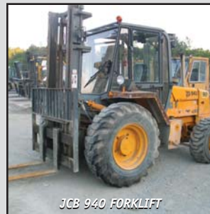
JCB 940 FORKLIFT