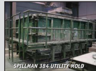
SPILLMAN 384 UTILITY MOLD