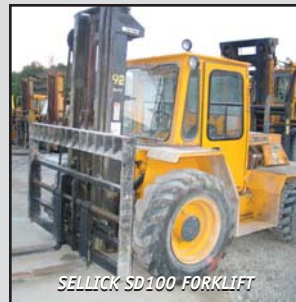
SELICK SD100 FORKLIFT