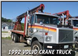
1992 VOLVO CRANE TRUCK