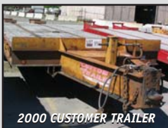
2000 CUSTOMER TRAILER