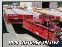
1999 CUSTOMER TRAILER