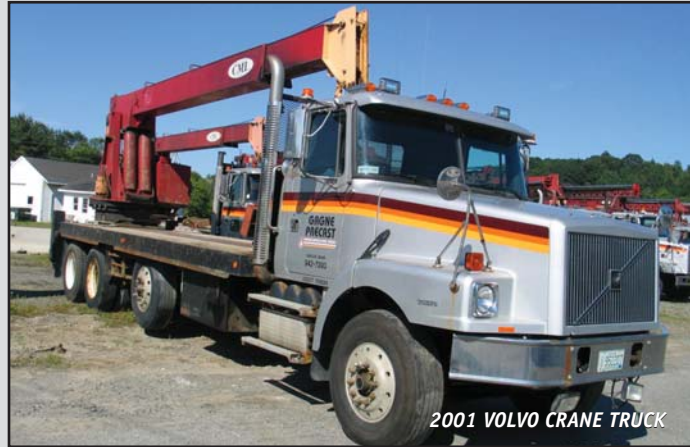
2001 VOLVO CRANE TRUCK

To apply online go to: www.harbourcapital.com