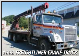
1992 FREIGHTLINER CRANE TRUCK