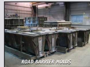
ROAD BARRIER MOLDS