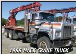
1988 MACK CRANE TRUCK