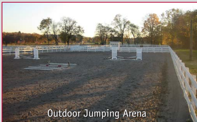
Outdoor Jumping Arena