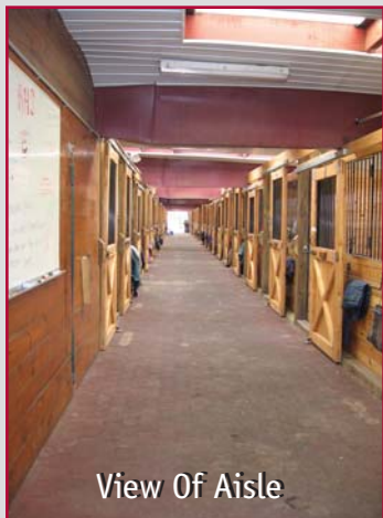
View Of Aisle

455 Crook Horn Road Southbury, Connecticut