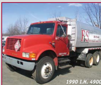
1990 I.H. 4900