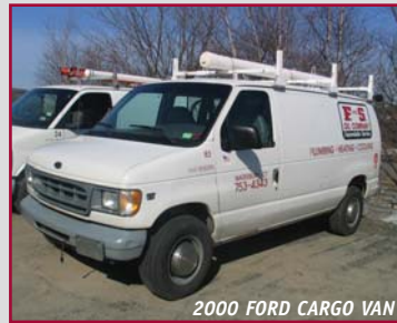
2000 FORD CARGO VAN

325 SANDBANK ROAD, CHESHIRE, CT • TO BE SOLD AT 4:00 P.M.