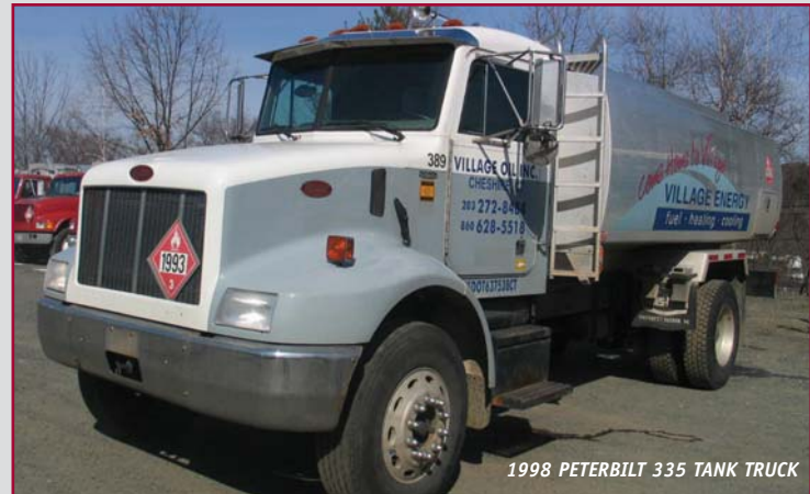
1998 PETERBILT 335 TANK TRUCK