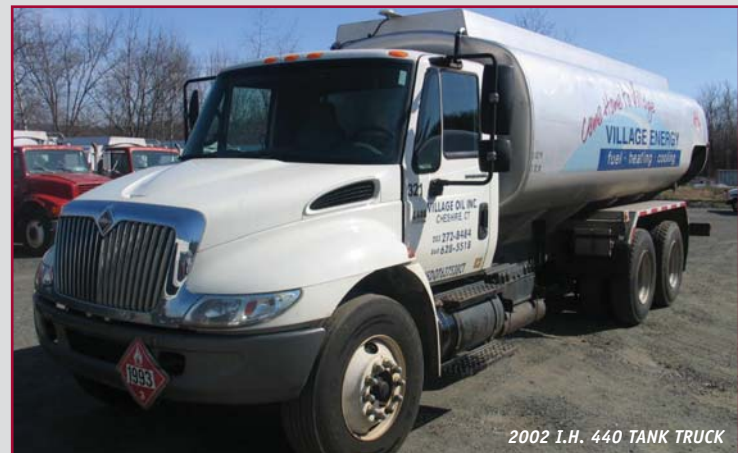
2002 I.H. 440 TANK TRUCK

To apply online go to: www.harbourcapital.com