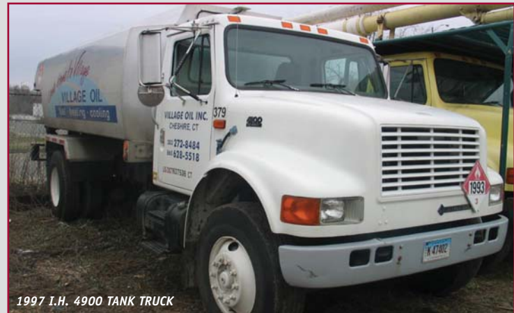
1997 I.H. 4900 TANK TRUCK