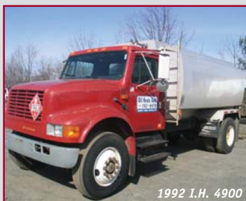
1992 I.H. 4900