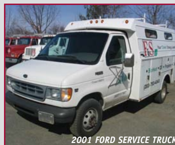
2001 FORD SERVICE TRUCK