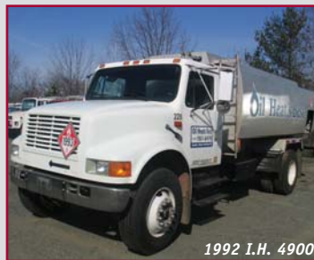
1992 I.H. 4900