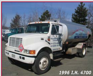
1996 I.H. 4700