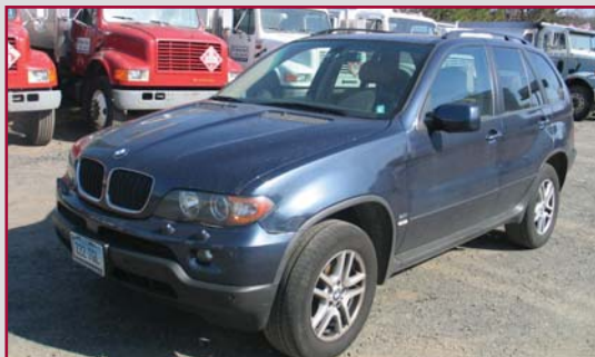
2004 BMW X5 SUV