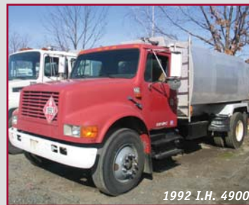
1992 I.H. 4900