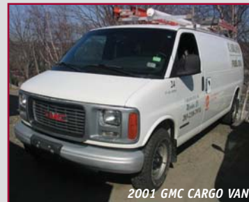
2001 GMC CARGO VAN