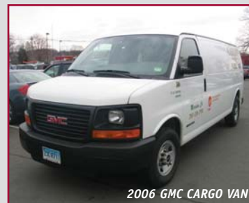
2006 GMC CARGO VAN