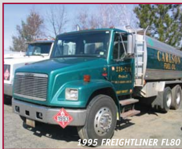
1995 FREIGHTLINER FL80