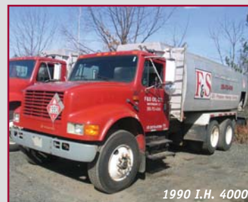
1990 I.H. 4000