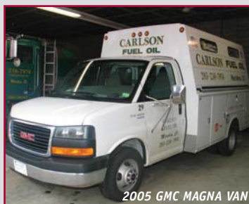
2005 GMC MAGNA VAN