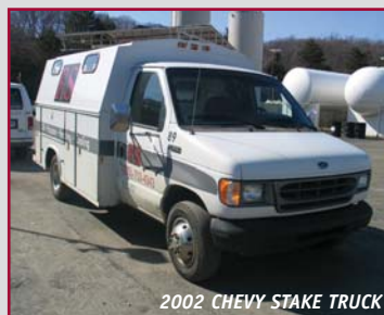
2002 CHEVY STAKE TRUCK