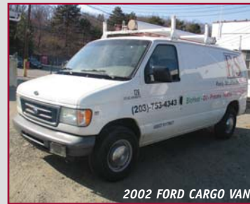
2002 FORD CARGO VAN