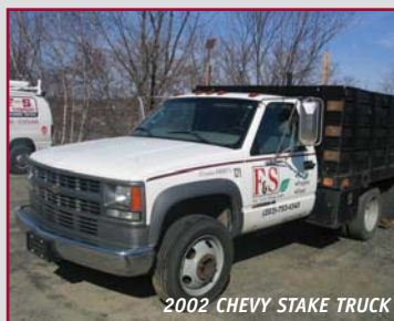
2002 CHEVY STAKE TRUCK