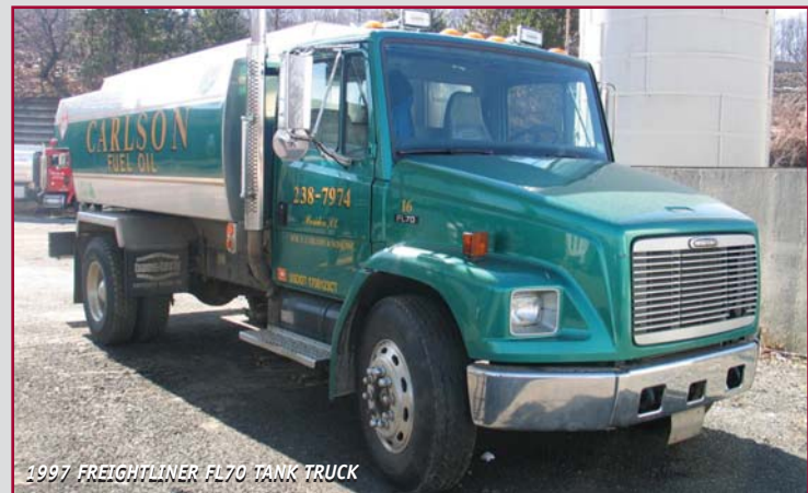
1997 FREIGHTLINER FL70 TANK TRUCK