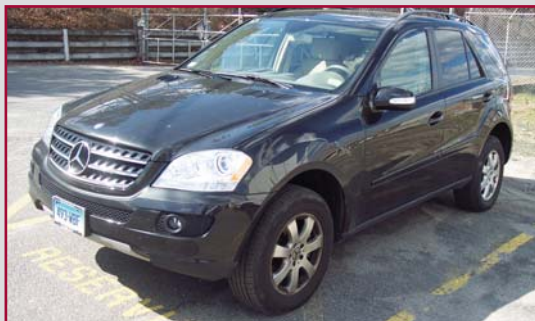
2007 MERCEDES ML350 SUV

WEDNESDAY, APRIL 30 TH STARTING AT 10:30 A.M. 532 SOUTH LEONARD STREET, WATERBURY, CONNECTICUT