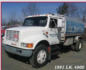
1991 I.H. 4900