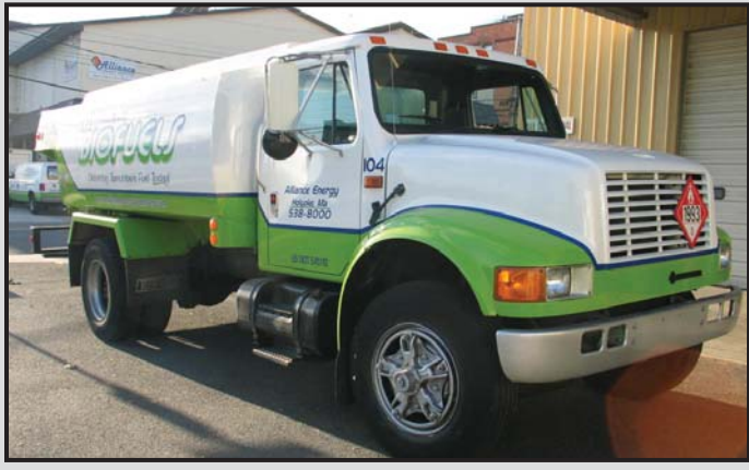
1991 I.H. TANK TRUCK