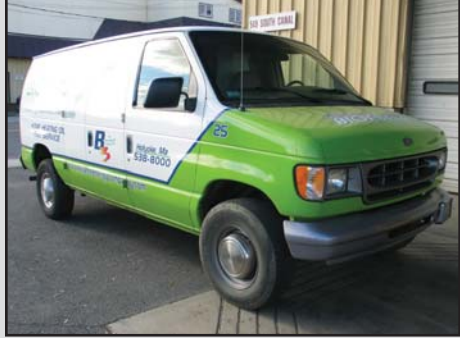
1998 FORD CARGO VAN