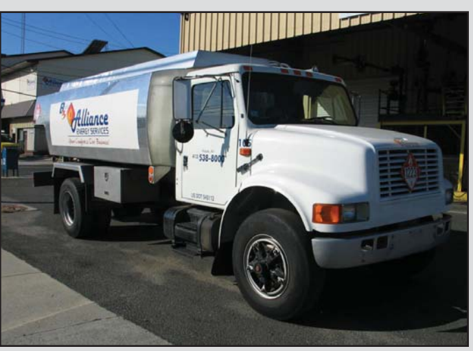
1995 I.H. TANK TRUCK