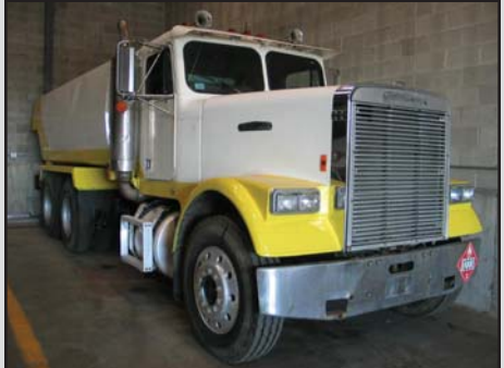
1987 FREIGHTLINER TANK TRUCK