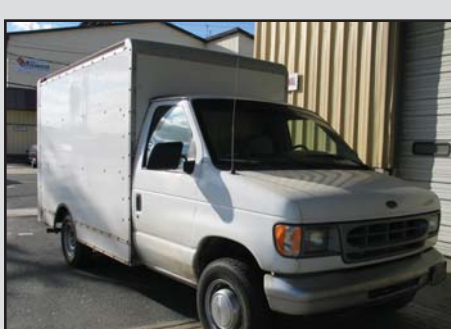
1990 FORD 10' BOX TRUCK