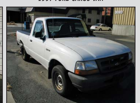
1998 FORD RANGER