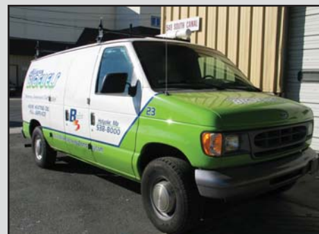
1997 FORD CARGO VAN