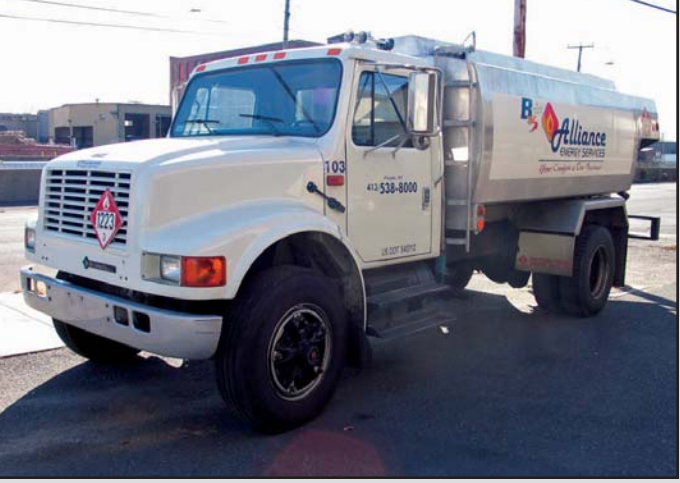
1993 I.H. TANK TRUCK

<u> Aaron Posnik</u> Visit our Website @ www.posnik.com