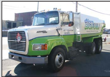
1990 FORD AERMAX TANK TRUCK

MA Auc. Lic. #161 • Est. 1932 • PA Auc. Lic. #AU-003822-R