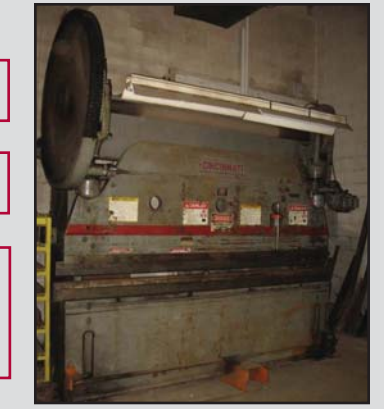
CINCINNATI 10' BRAKE