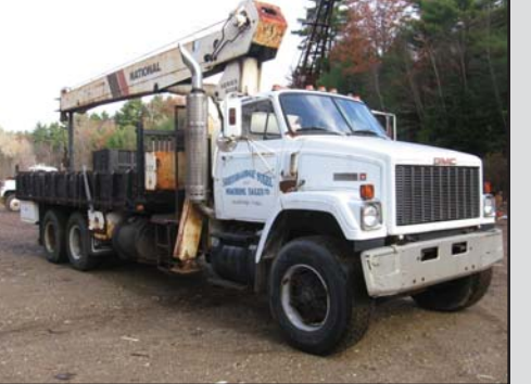
1985 GMC TRUCK CRANE