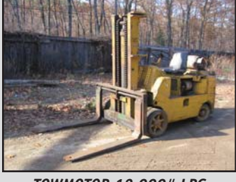
TOWMOTOR 12,000# LPG FORKLIFT TRUCK