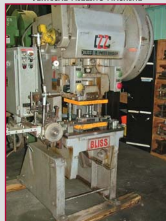
BLISS PUNCH PRESS