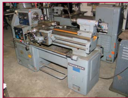
TAKISAWA WEBB ENGINE LATHE