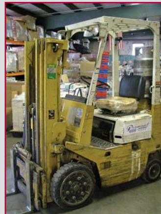
TCM FORKLIFT TRUCK