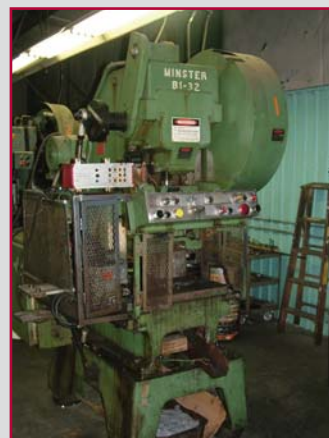
MINISTER PUNCH PRESS