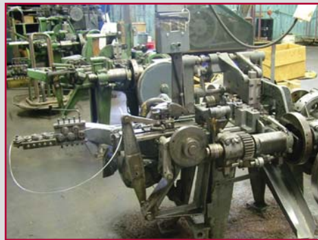
AUTO FOUR SLIDE

MA Auc. Lic. #161 • Est. 1932 • PA Auc. Lic. #AU-003822-R