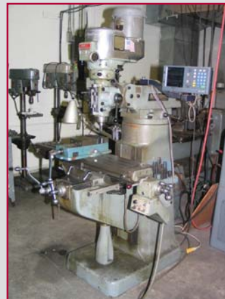
BRIDGEPORT SERIES I VERTICAL MILLING MACHINE