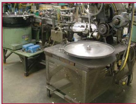
ROTARY INSERT ASSEMBLY MACHINES