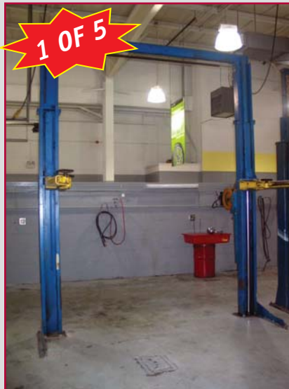
BENWIL LIFT 7,000# MOD. T-PRO-7