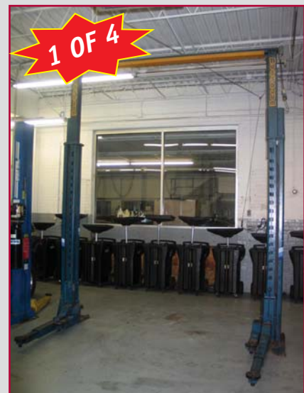
NUSSBAUM LIFT 7,000# MOD. STL-7000