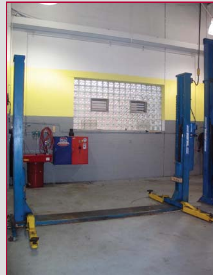
BENWIL LIFT 9,000# MOD. GP9