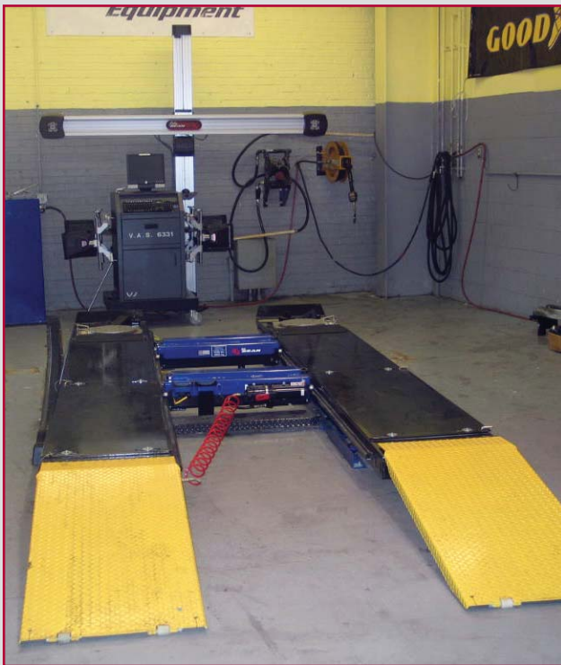
JOHN BEAM WHEEL ALIGNMENT SYSTEM

INSPECTION: MONDAY, AUGUST 6 TH – 10:00 A.M. TO 4:00 P.M. & MORNING OF SALE – 8:30 A.M. TO 11:00 A.M.