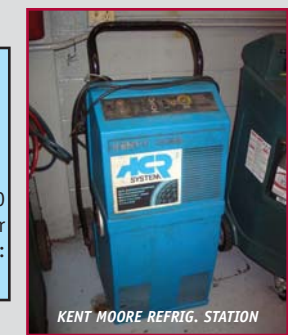
KENT MOORE REFRIG. STATION