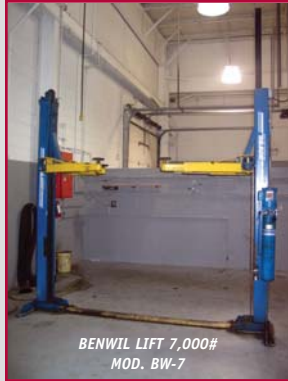
BENWIL LIFT 7,000# MOD. BW-7