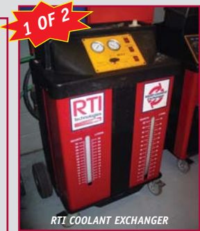
RTI COOLANT EXCHANGER

Maximize your bidding power! Get pre-approved for up to $125,000 in lease financing. For more information call Jack Trainor at Harbour Capital at 866-735-2657. To apply online go to: www.harbourcapital.com