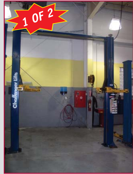
CHALLENGER LIFT 9,000# MOD. CL9-9