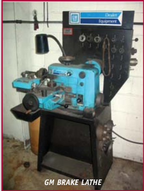
GM BRAKE LATHE