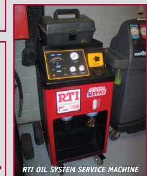
RTI OIL SYSTEM SERVICE MACHINE