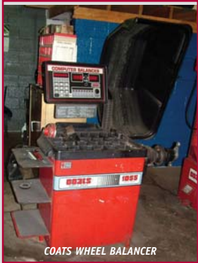
COATS WHEEL BALANCER