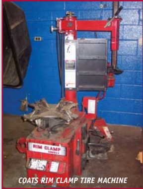
COATS RIM CLAMP TIRE MACHINE