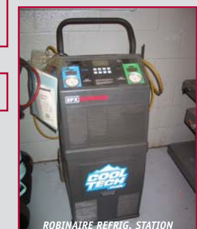
ROBINAIR REFRIG. STATION