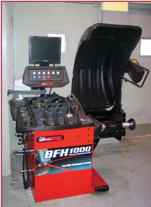
JOHN BEAM WHEEL BALANCER

10% BUYERS PREMIUM APPLIES ON ALL ONSITE PURCHASES 13% BUYERS PREMIUM APPLIES ON ALL INTERNET PURCHASES