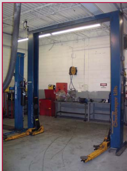
VBM LIFT 7,000# MOD. 31000