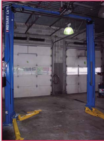
ROTARY LIFT 10,000# MOD. SPOA10N700