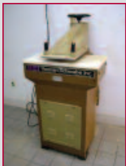
HERMAN SCHWABE DIE CLICKER