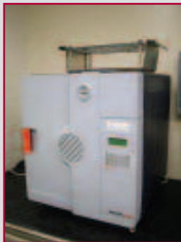
DATACOLOR LAB DYE MACHINE