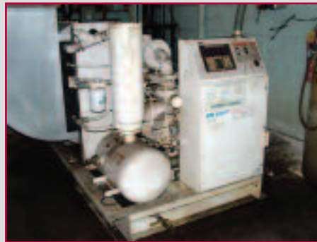
GARDNER-DENVER 100 H.P. AIR COMPRESSOR