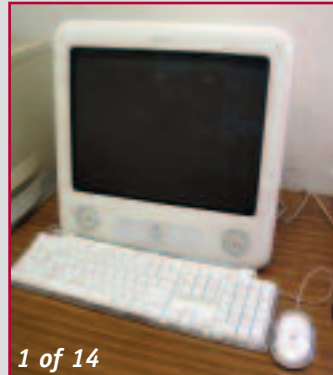
1 of 14