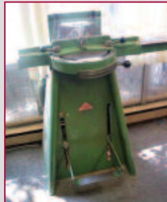
MORSO MITER CUTTER