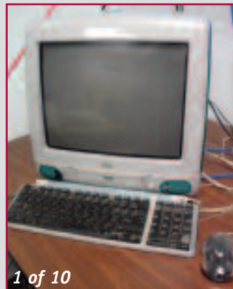
1 of 10