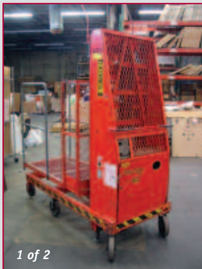
1 of 2