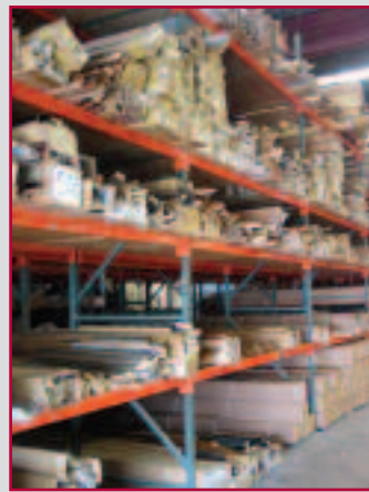
PARTIAL VIEW OF PICTURE MOLDING