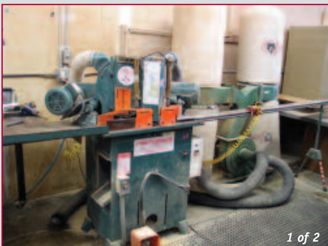
1 of 2