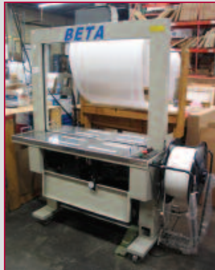
BETA AUTO STRAPPER